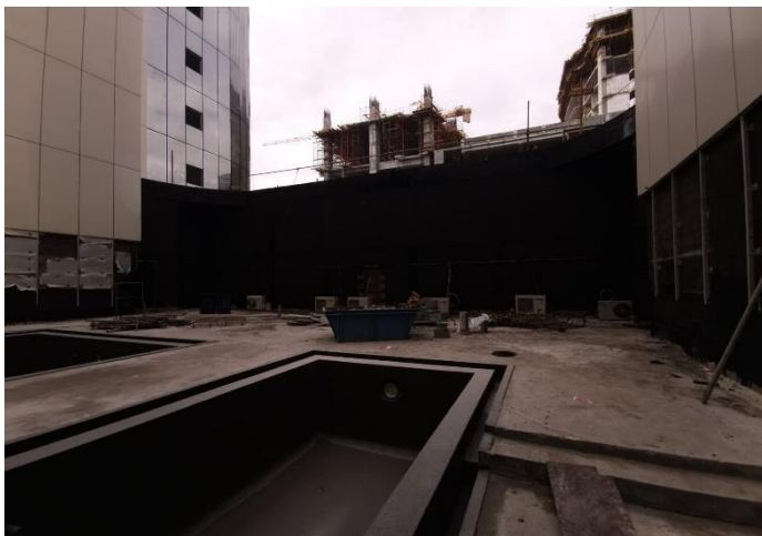
Application of Waterproofing for Swimming Pool Area at Ground Floor