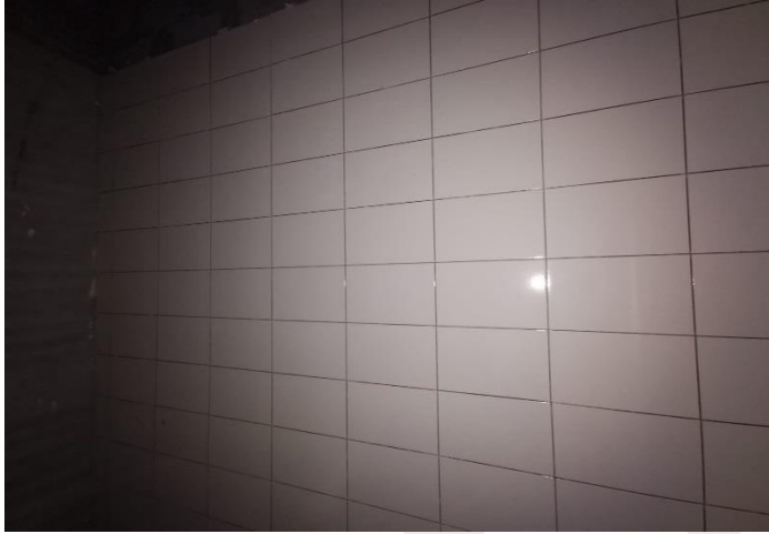
Fixing of Wall Tiles for Toilet Area