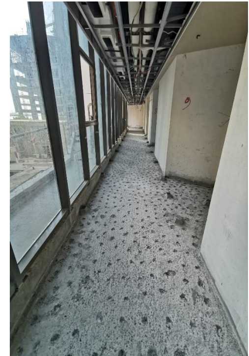
Screed Works for Corridor Area at Typical Floors