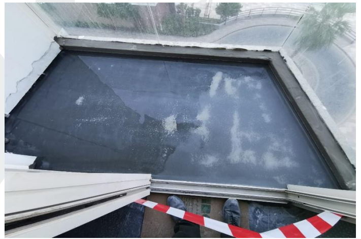
Water Leakage Test for Balcony Area