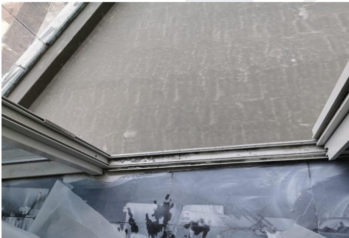
Application of Waterproofing for Balcony Area