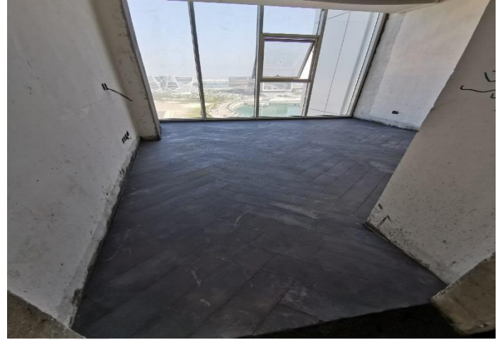
Marble Work inside the Flat at Typical Floors