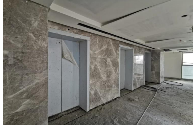
Gypsum Ceiling and Marble Wall Cladding Works for Lift Lobby Area at Typical Floors