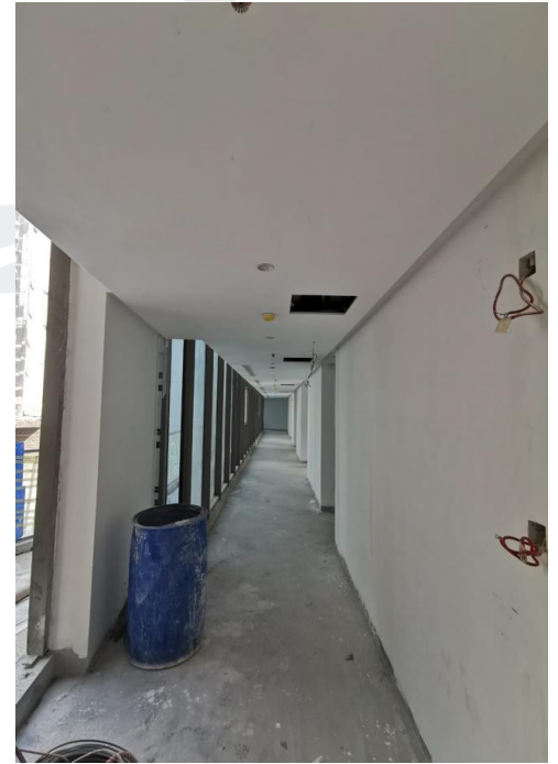
Gypsum Ceiling and Painting Works for Corridor Area at Typical Floors