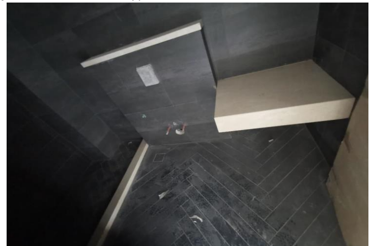
Tiling Works for Bathrooms at Typical Floors