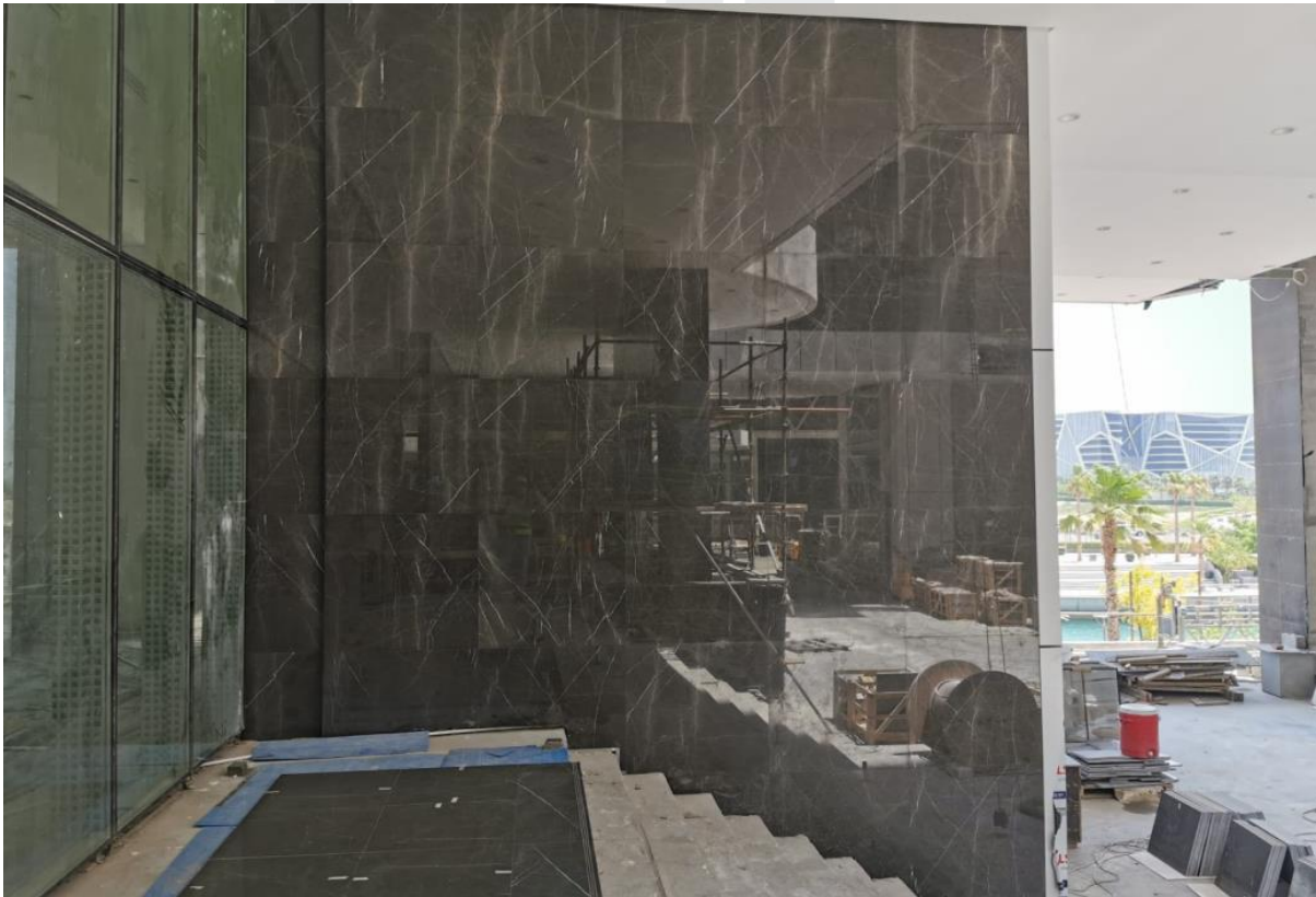
Fixing Marble Wall Cladding at Main Entrance