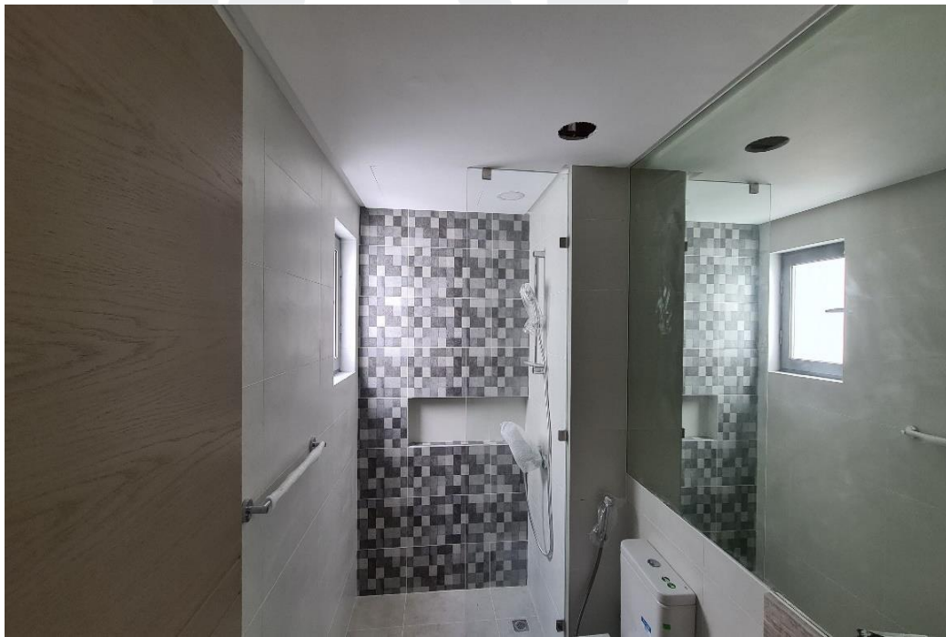
Shower Partition installation in progress