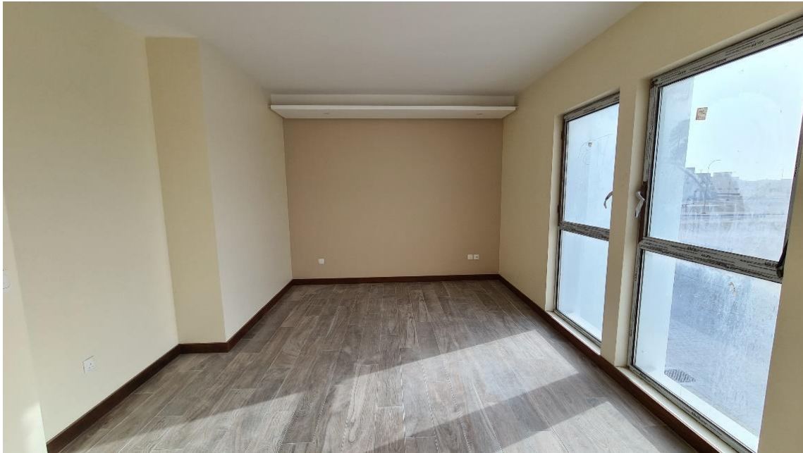
Aluminum Windows installation in progress