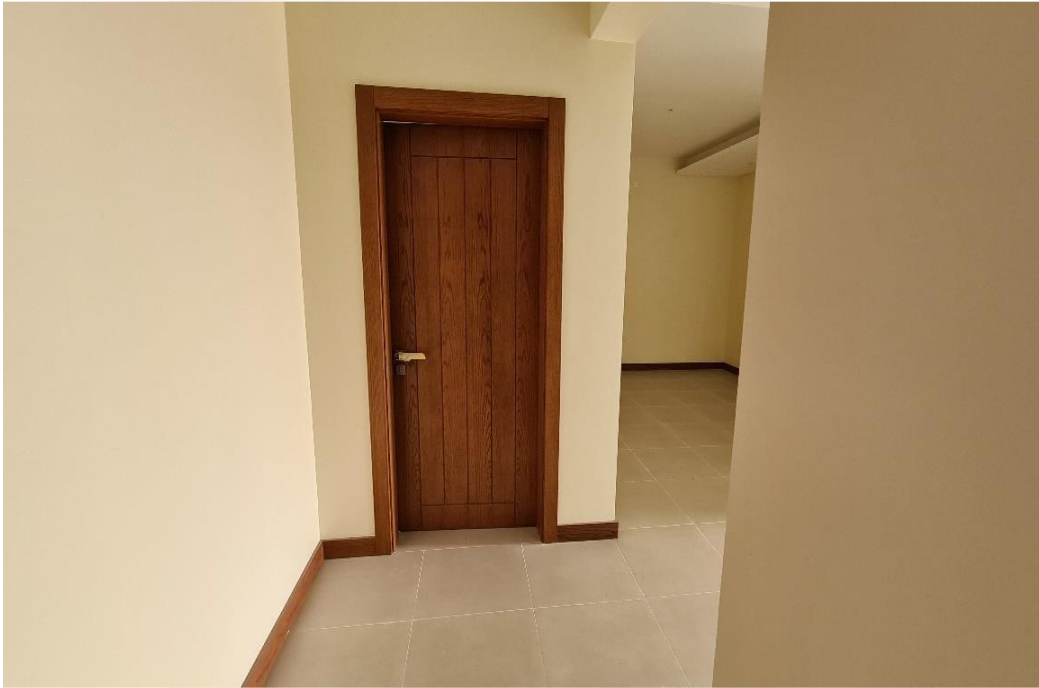
Internal door installation in progress