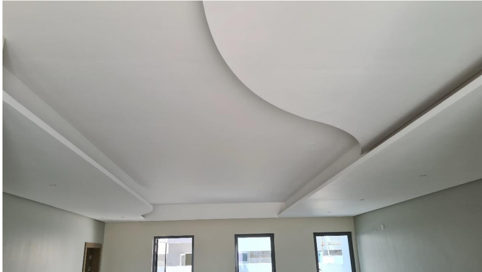
Internal Painting in progress