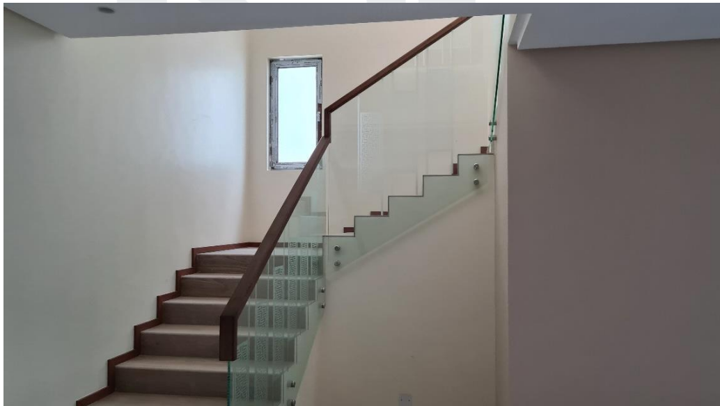
Staircase Handrail installation in progress