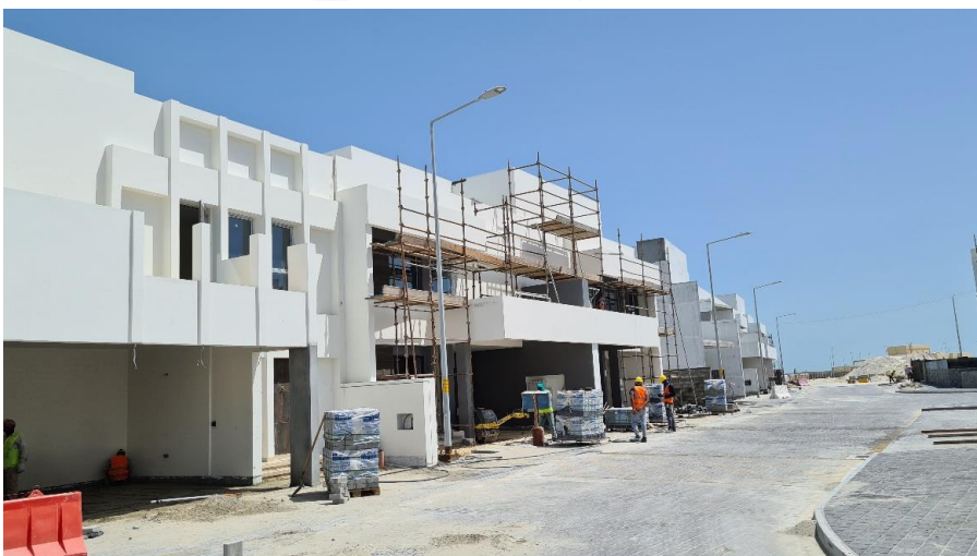
Street View Phase 1 Villas