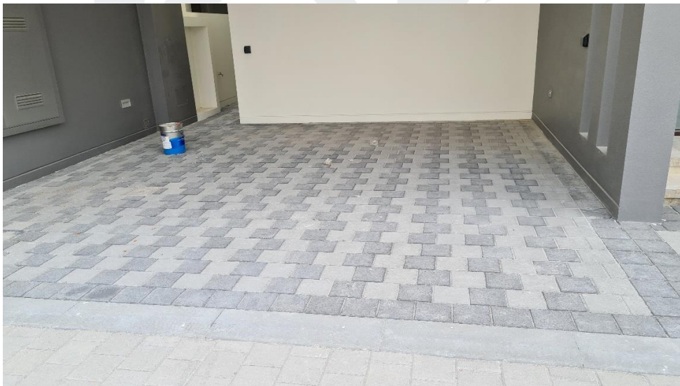
Garage Interlock installation in progress