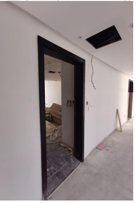
Painting and Door Works at Typical Floors