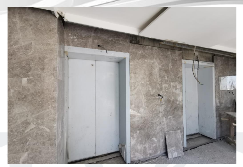
Marble Wall Cladding Work for Lift Lobby Area at Typical Floors