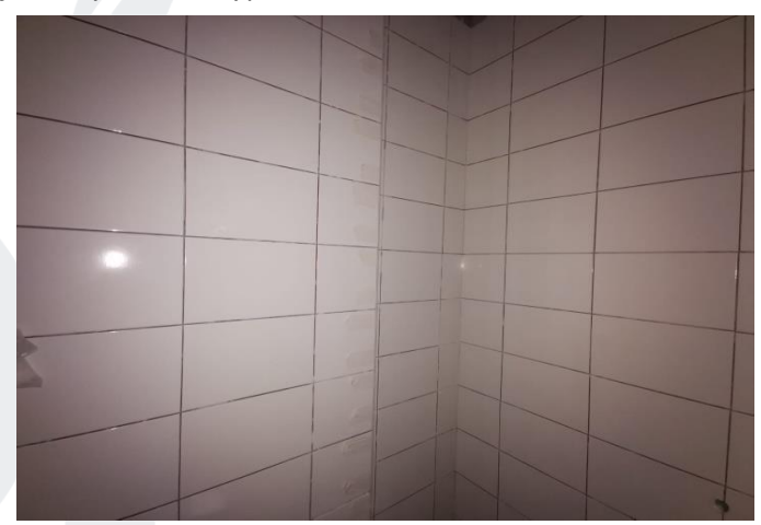
Tiling Works for Bathroom at Typical Floors