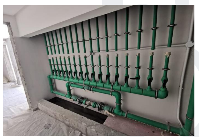
Installation of MEP Services at Typical Floors