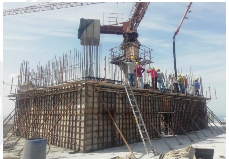
42 nd Floor – Concrete Work for Shear Wall