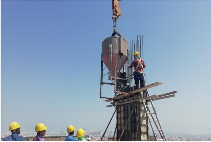
41 st Floor – Concrete Work for Column