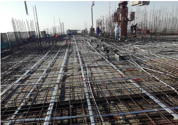
41 st Floor – Steel Work