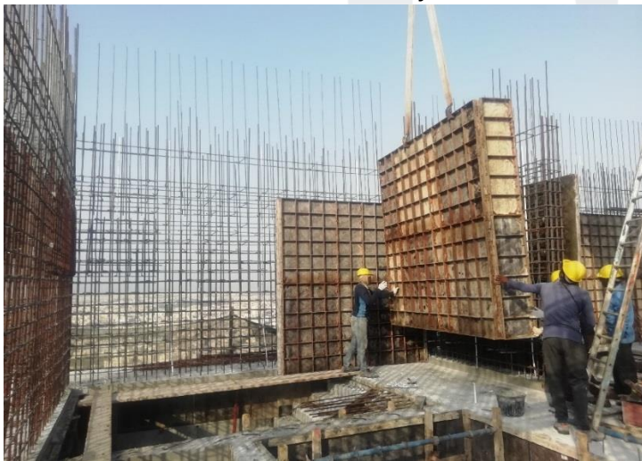
42 nd Floor – Shuttering Work for Shear Wall