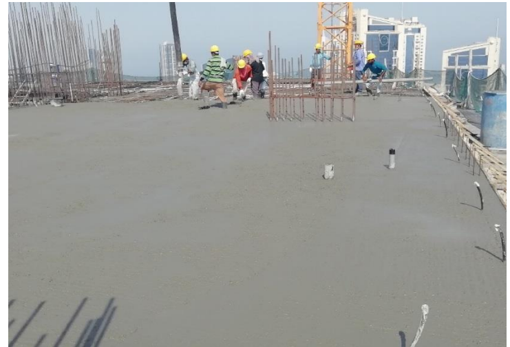
42 nd Floor – Concrete Work