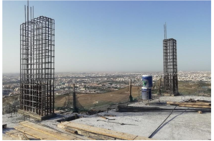
42 nd Floor – Steel Work for Column