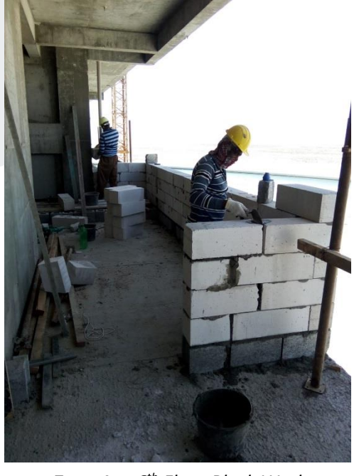
Zone 4 to 6<sup>th</sup> Floor Block Works