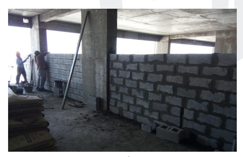
Zone 4 to 5<sup>th</sup> Floor Block Works