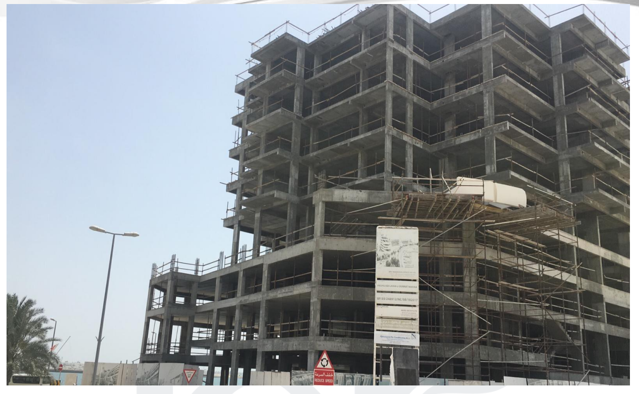
Right Hand Side Elevation