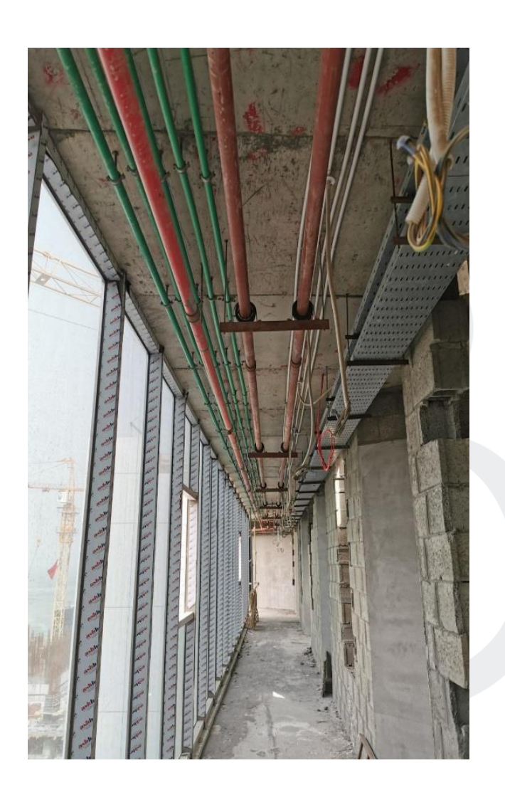
Installation of MEP Services at Typical Floors