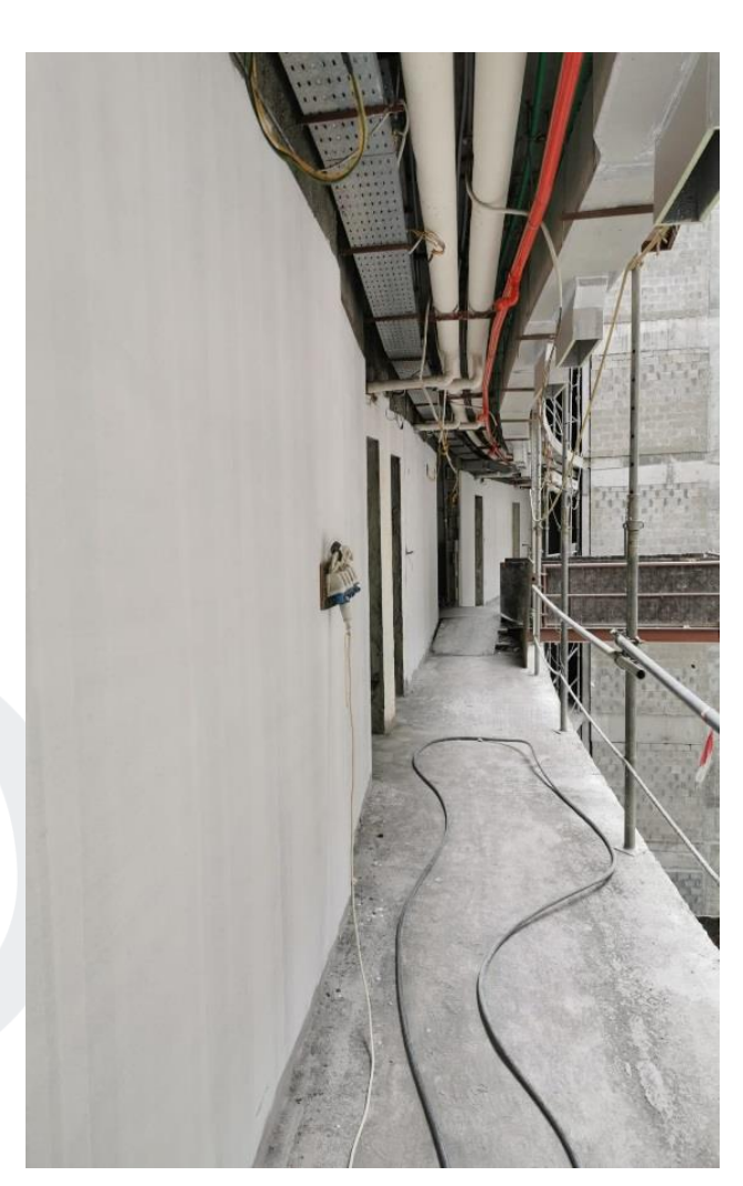
Plastering Works for walls at Typical Floors