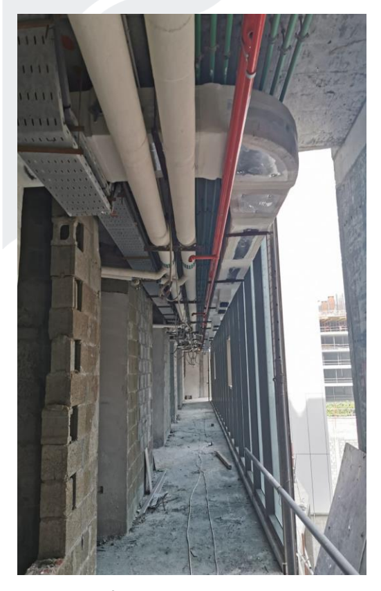
Installation of MEP Services at Typical Floors