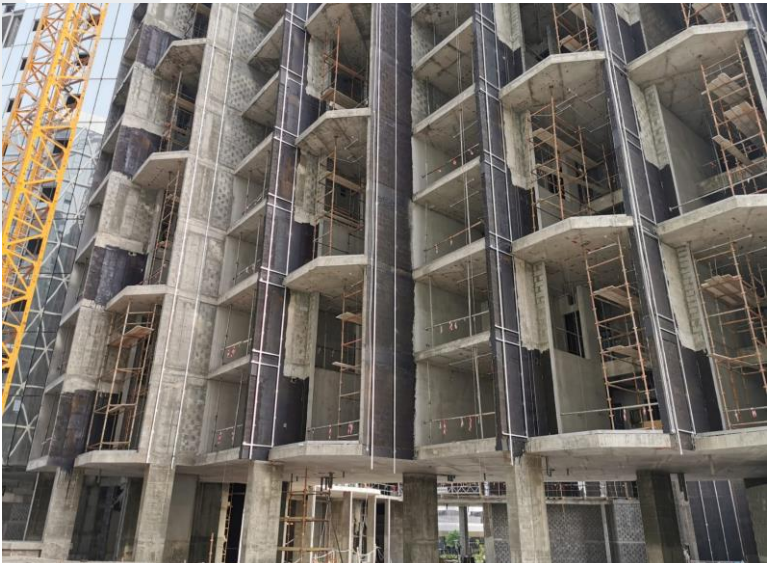
Installation of Aluminum Works (Brakets, Mullion, Rockwool, ACP Cladding and Glass and Application of Bitumen Paint)