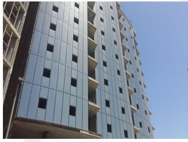
Installation of Aluminum Works (Brakets, Mullion, Rockwool, ACP Cladding and Glass and Application of Bitumen Paint)