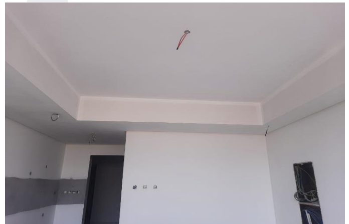
Gypsum and Painting Works