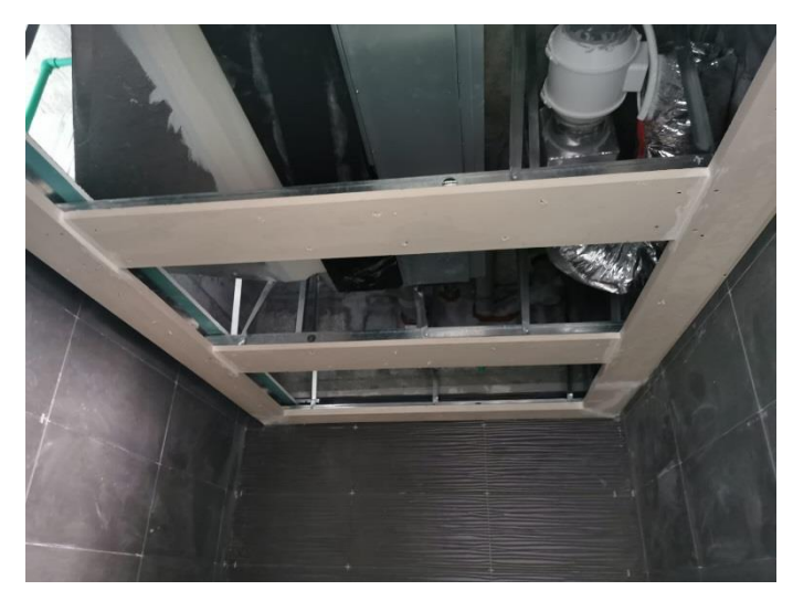
Ceiling Framing and MEP Services Works at Typical Floors