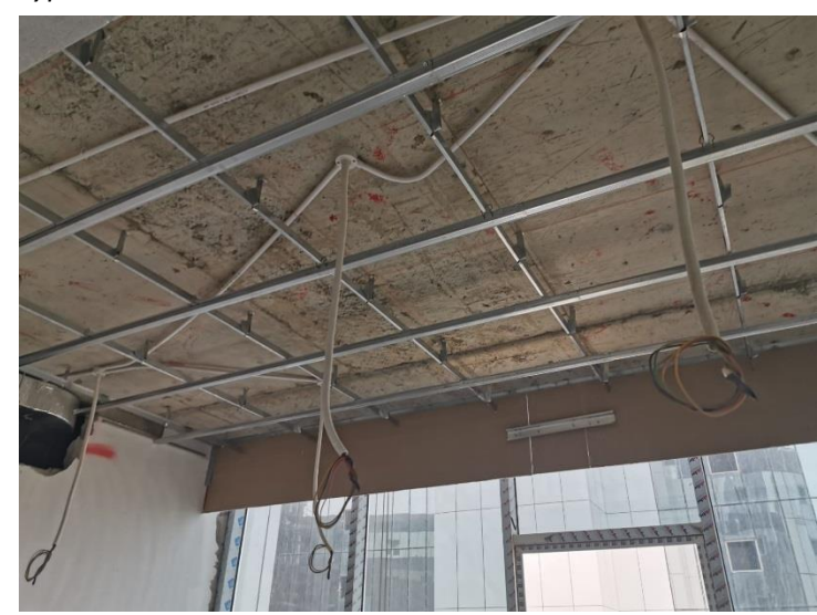
Ceiling Framing Works at Typical Floors