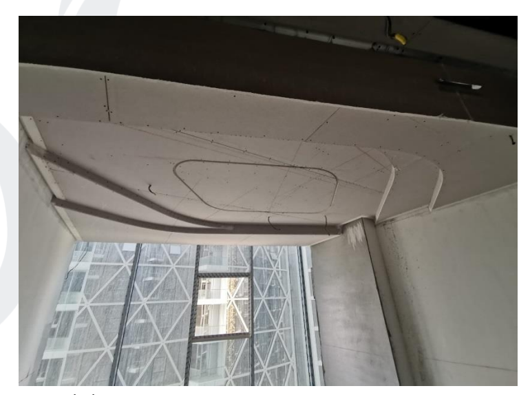
Ceiling Works at Typical Floors