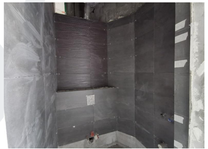
Tile Works for Toilet at Typical Floor