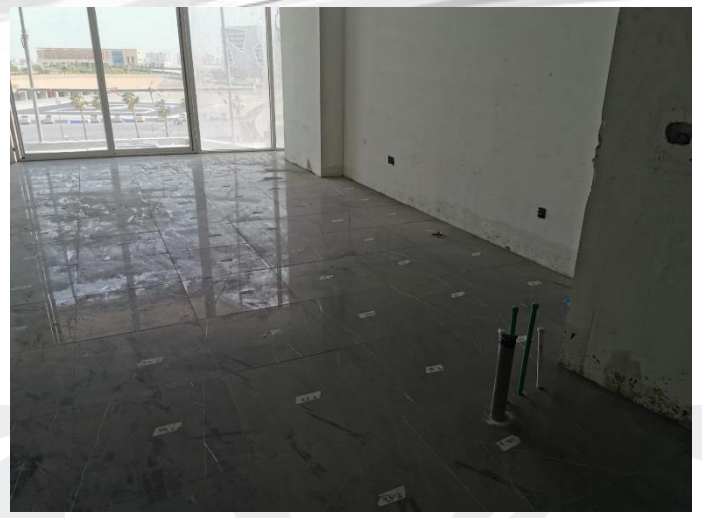
Marble Works for Rooms at Typical Floors