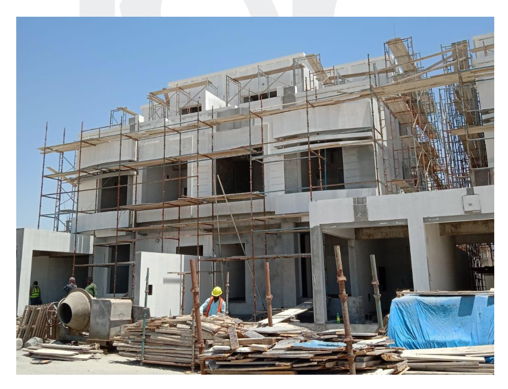
Villa 5 & 6 Overall View