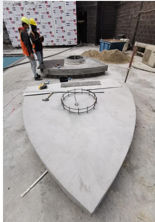
Concrete Works for the Swimming Pool Bench at Ground Floor