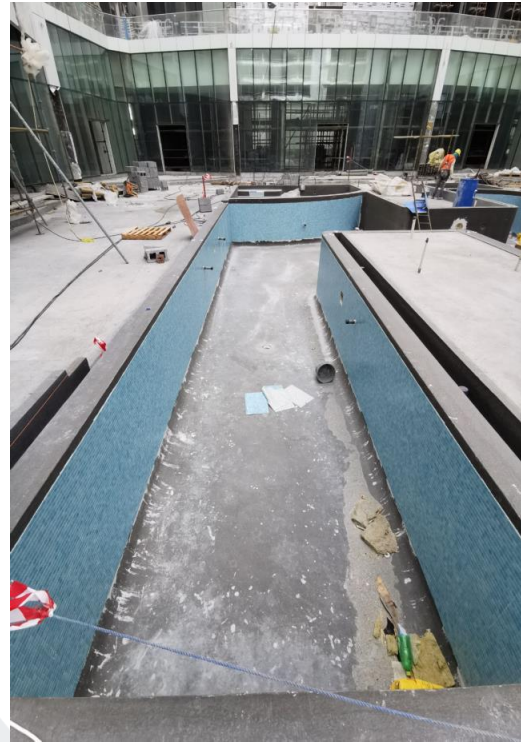
Swimming Pool Works at Ground Floor