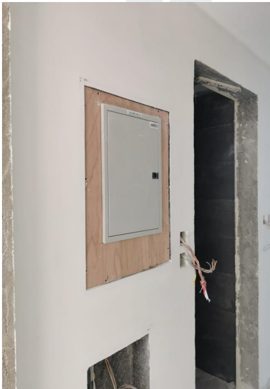
DB Works at Typical Floors