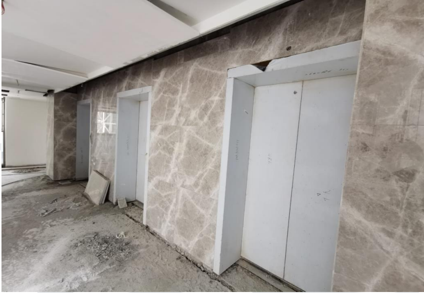
Fixing of Marble Wall Cladding for Lift Lobby Area at Typical Floors