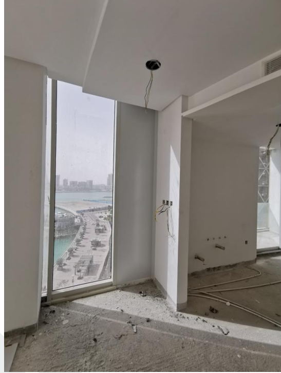
Painting works at typical floors