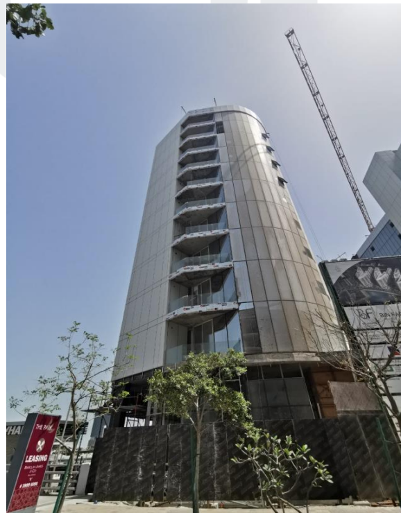
Installation of Aluminum Works (Brackets, Mullion, Rockwool ACP Cladding & Glass and Application of Bitumen Paint)