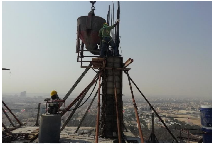
39 th Floor – Concrete Work for Shear Wall