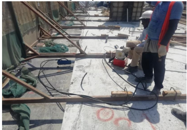
40 th Floor – PT Slab Stressing Work