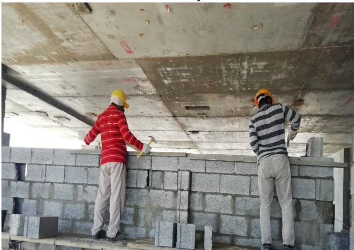
24 th Floor – Block Work