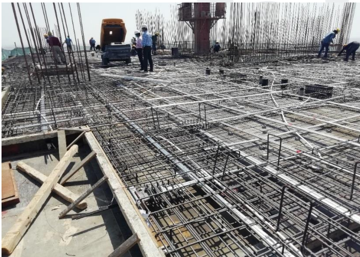
40 th Floor – Steel Work for Floor Slab