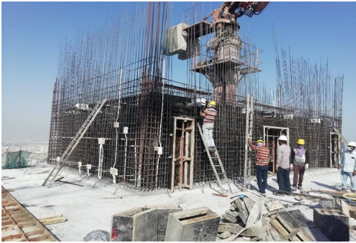
40 th Floor – Shuttering Work for Shear