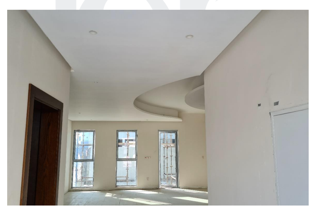
Villas Ceiling works in progress