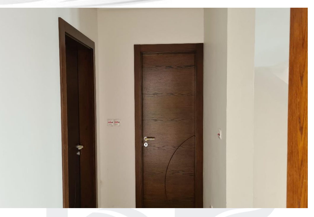
Wooden Doors & Skirting installation in progress