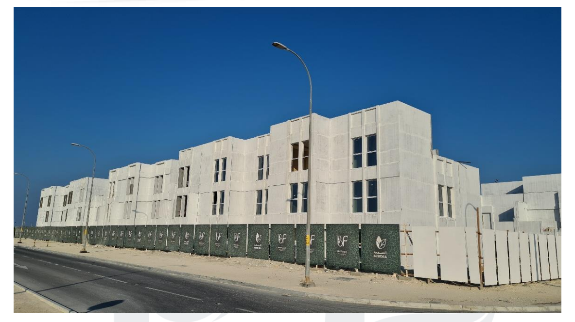
External Street View