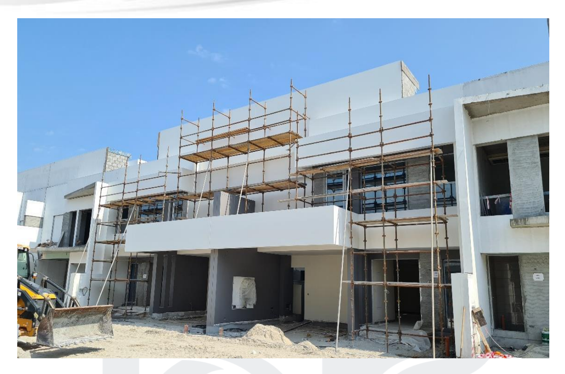
External Cladding Tile Installation in progress