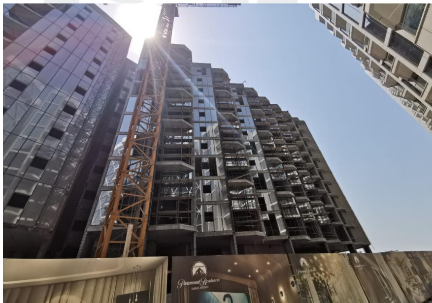
Installation of Aluminum Works (Brackets, Mullion, Rockwool ACP Cladding & Glass and Application of Bitumen Paint)