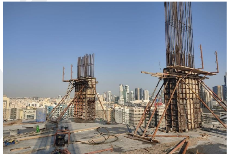
16 th Floor Column Form Work