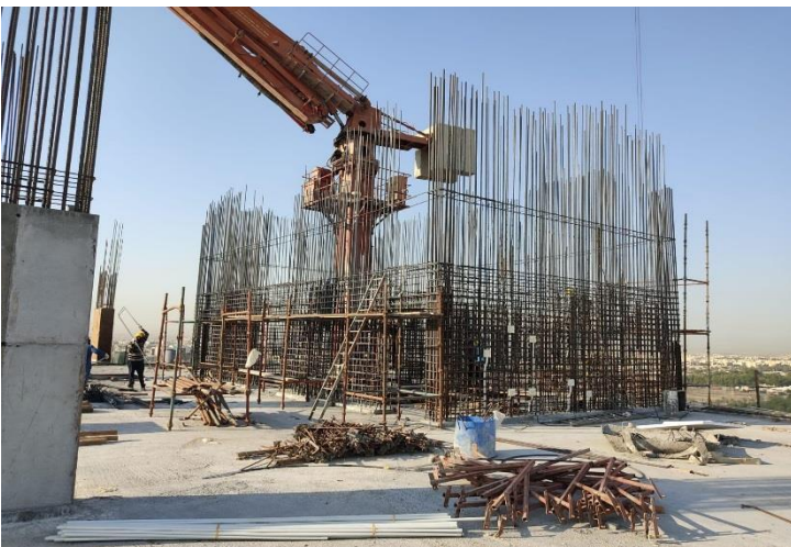
16 th Floor – Shear Wall Reinforcement Works