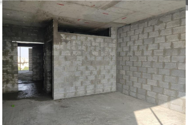
9 th Floor Flat Block Work