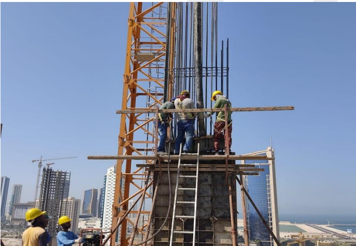
16 th Floor – Column Concrete Work