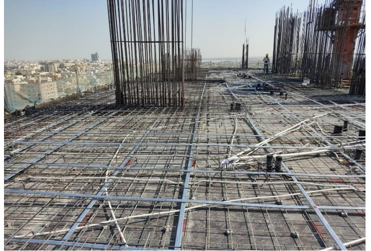
17 th Floor Slab Reinforcement Work