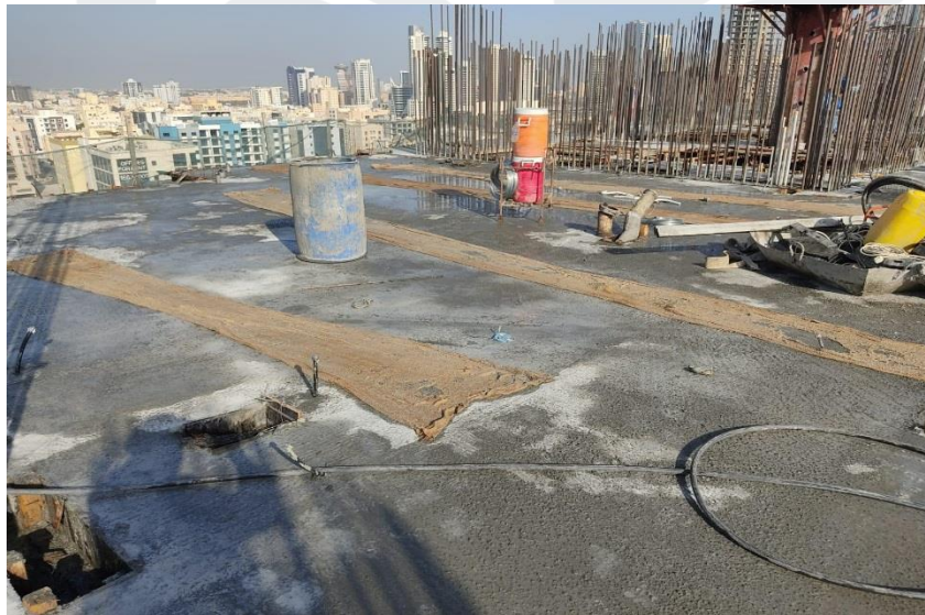
17 th Floor – Slab Water Curing Work