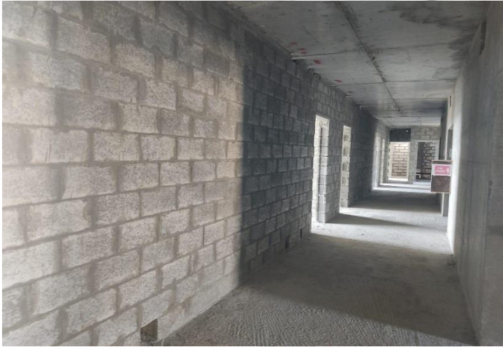
8 th Floor Corridor