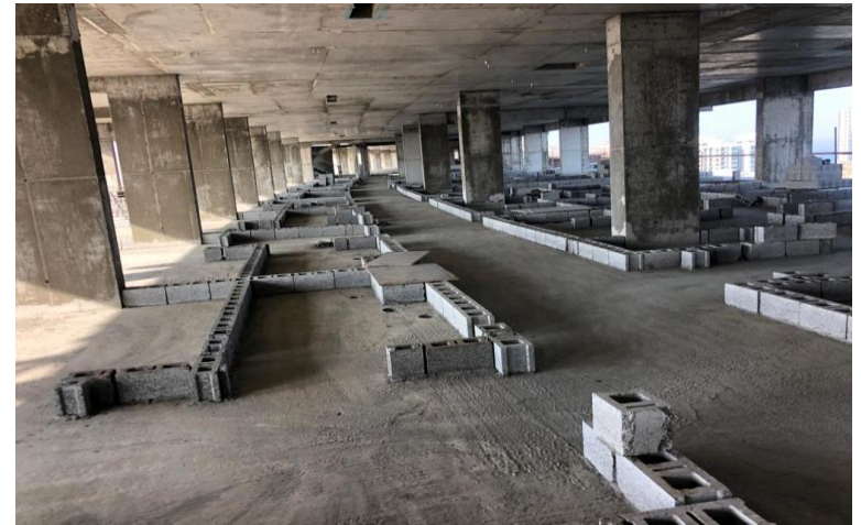
Zone 5 – 6 th Floor Block Work Setting Out