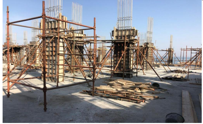
Zone 1 – 5 th Floor Column and Wall Shuttering Work