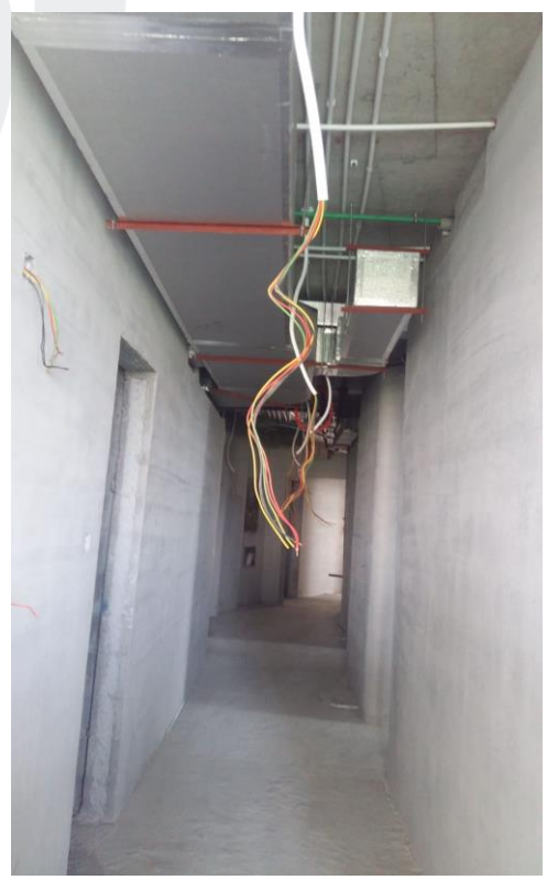
Plastering Works and Installation of MEP Services Works at Typical Floors