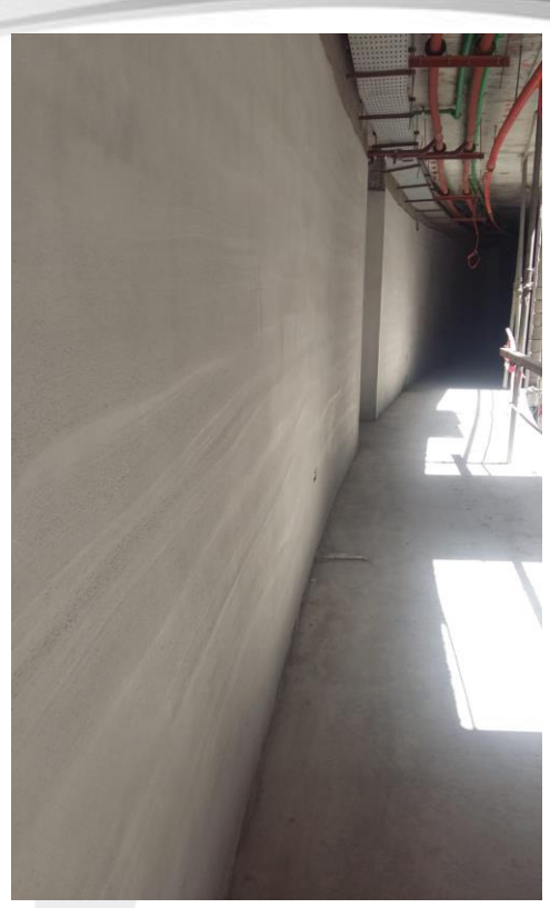
Plastering works at Typical Floors