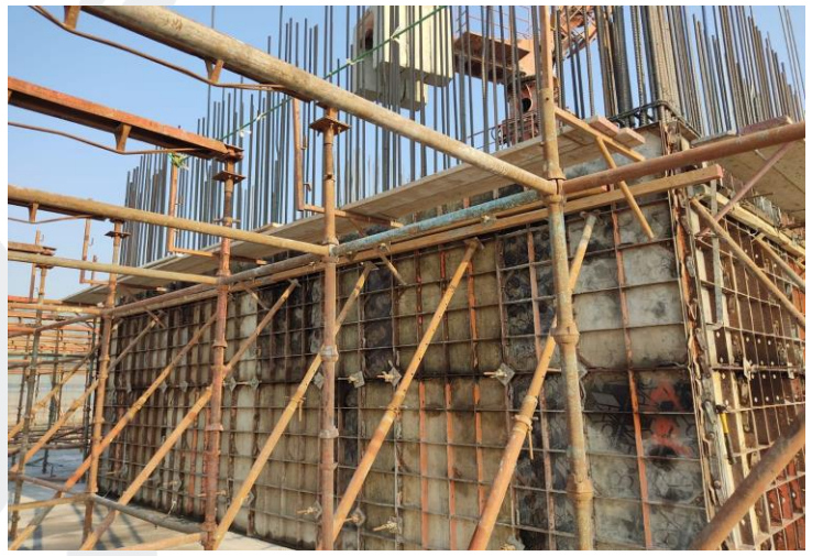
18<sup>th</sup> Floor Shear Wall Form Work