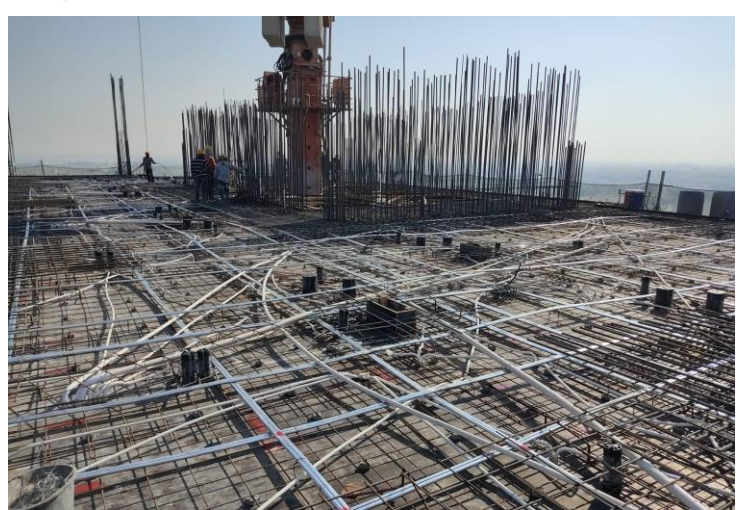
19<sup>th</sup> Floor – Slab Reinforcement Work