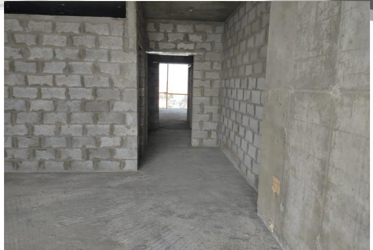
10<sup>th</sup> Floor Corridor