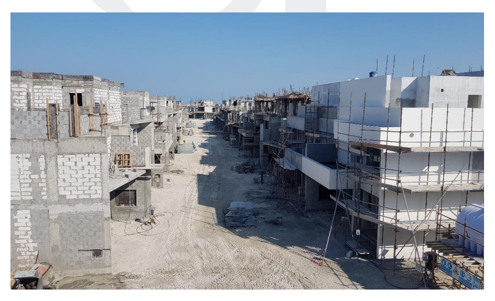
Street View Phase 1 Villas