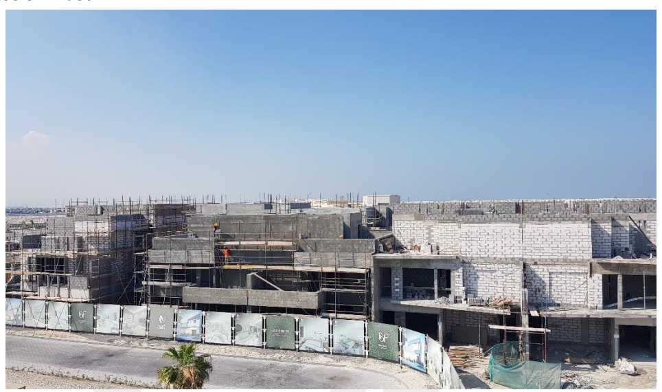
Aerial View Phase 1 Villas