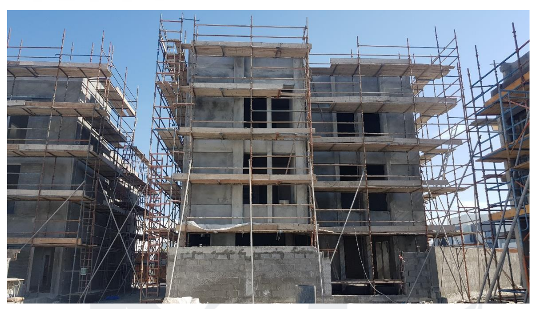
External plastering works in progress