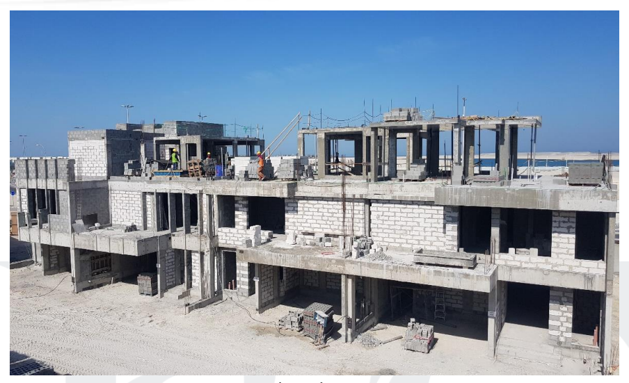
Structural works in progress