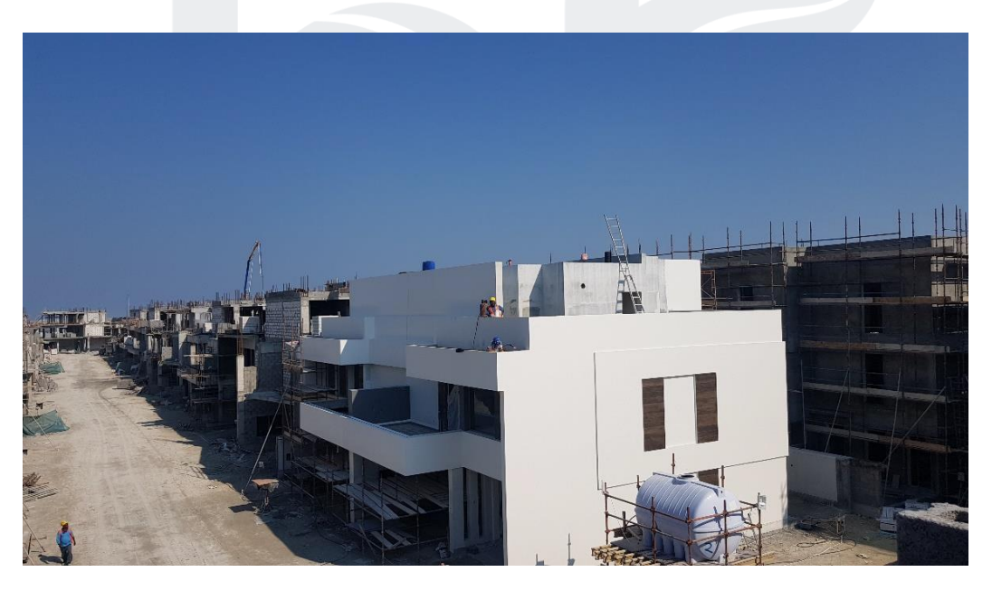
External pain application in progress