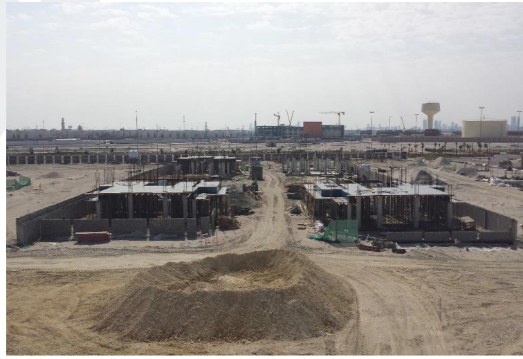
Aerial View of Phase 2 Villas