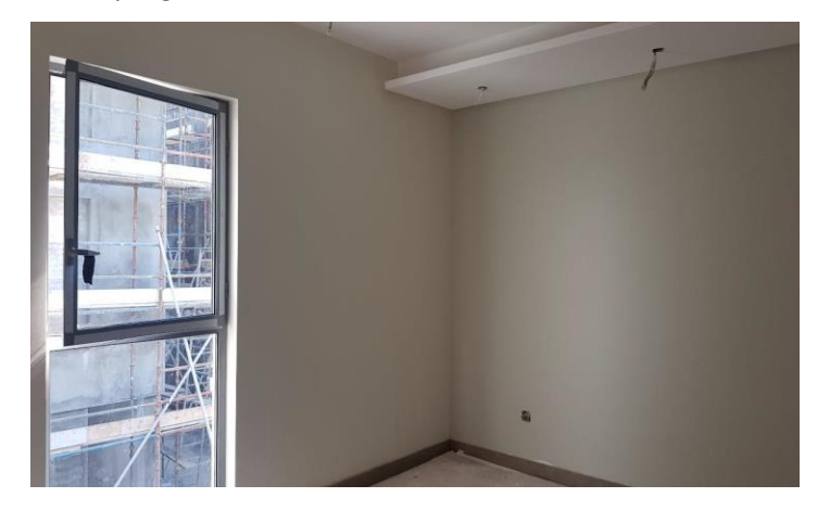
Aluminum Works in progress