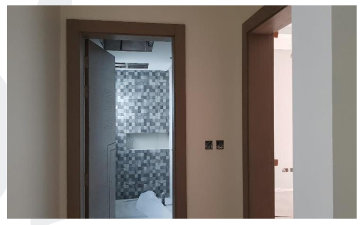
Internal Door installation in progress