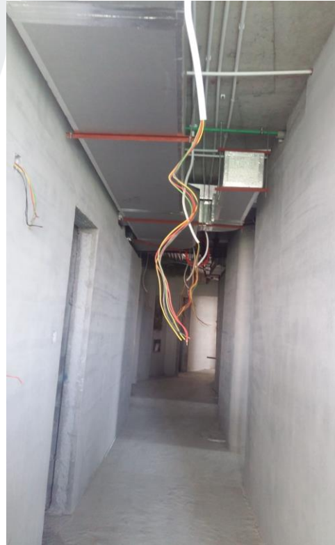
Plastering Works and Installation of MEP Services Works at Typical Floors