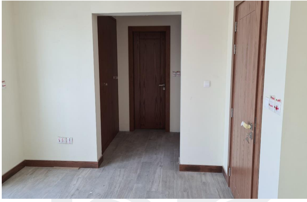
Wooden Doors & Skirting installation in progress