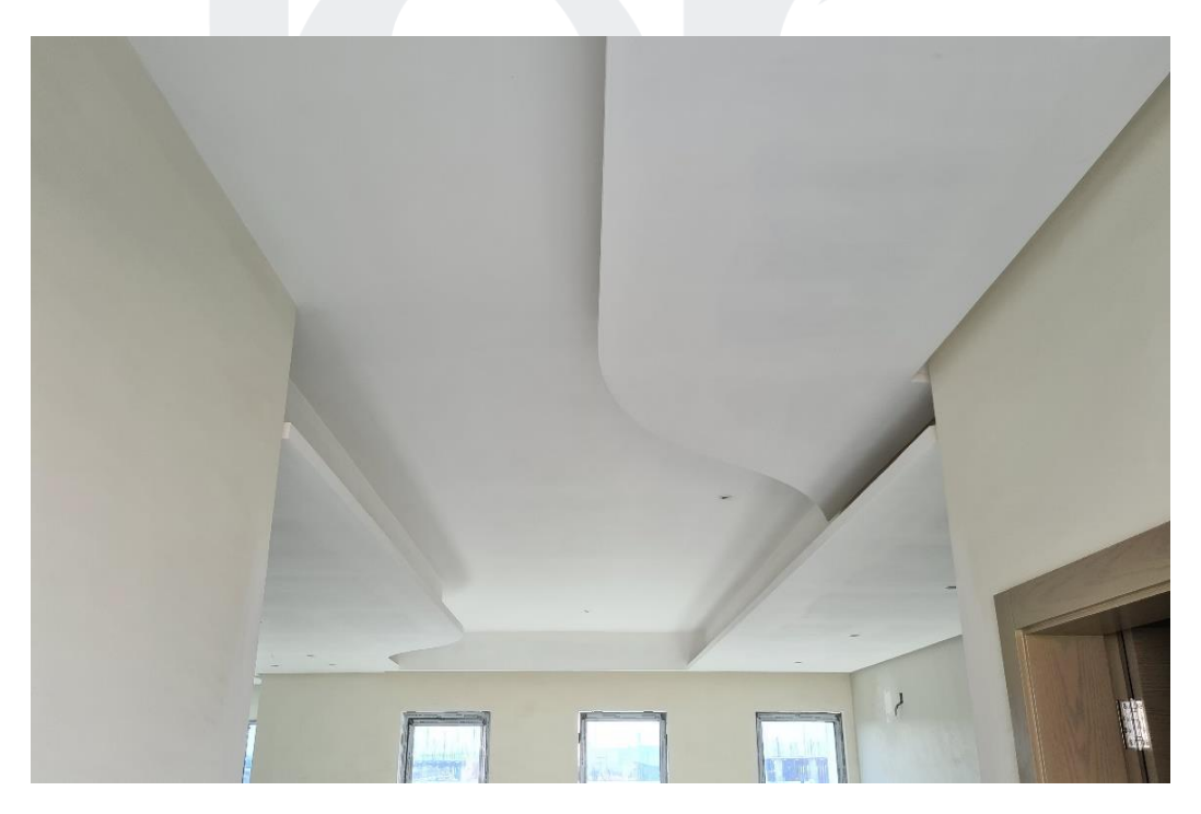
Villas Ceiling works in progress