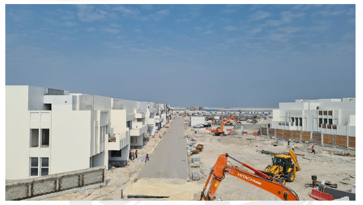
Street View Phase 1A Villas