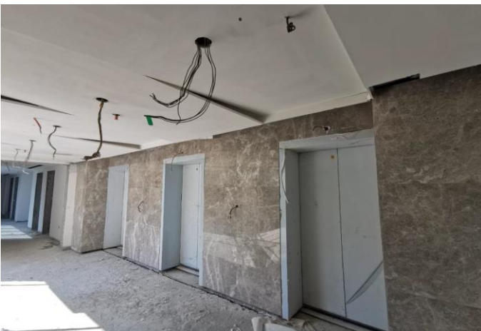
Marble Wall Cladding Works at Lift Lobby Typical Floor