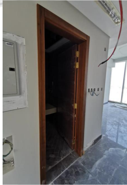
Installation of Doors at Typical Floors