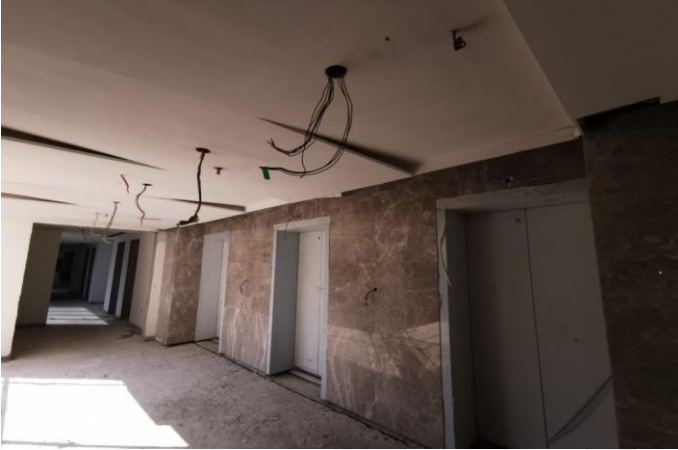
Gypsum Ceiling Works at Lift Lobby Typical Floors