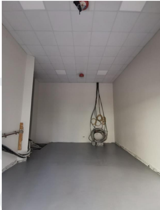
Epoxy Works for Electrical Room at Ground Floor