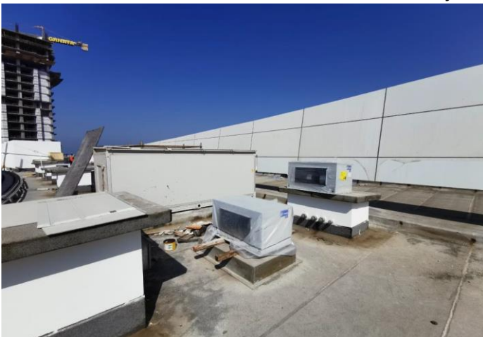
Installation of MEP Services at Roof Floor