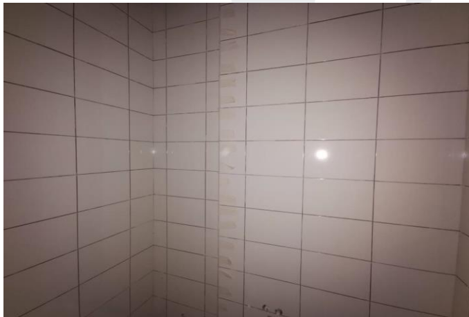
Tile Works at Typical Floors