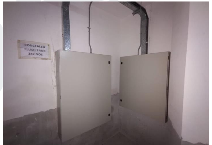
Installation of MEP Services at Basement