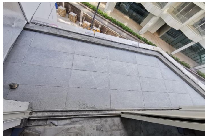
Tile Works for Balcony Area at Typical Floor