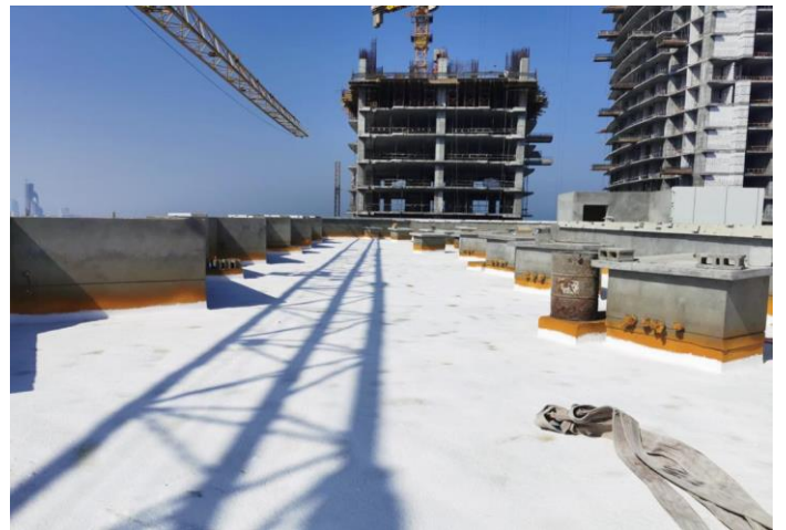
Waterproofing Works at Roof Floor