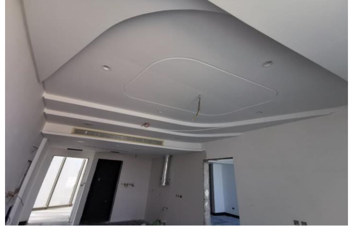
Gypsum Ceiling Works at Typical Floors