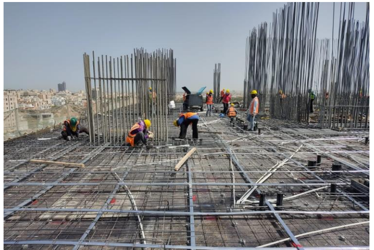
11 th Floor – Slab Reinforcement Work