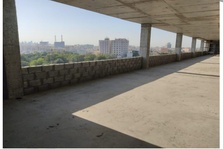
6 th Floor – Block Work