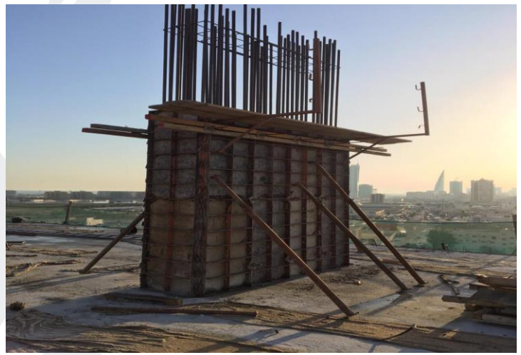
11 th Floor – Column Shuttering Work