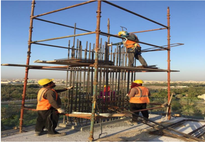
11 th Floor – Column Reinforcement Works