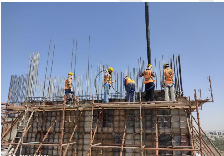
11 th Floor – Shear Wall Concrete Work