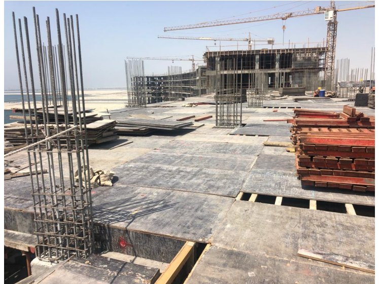
Zone 2 – 5 th Floor Works