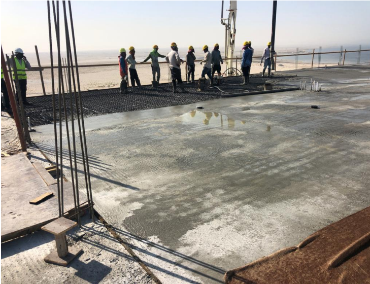
Zone 3 – Roof Slab Concrete