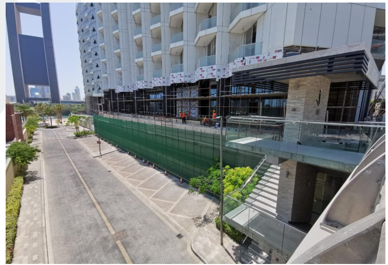
Installation of Aluminum Works (Brackets, Mullion, Rockwool ACP Cladding & Glass and Application of Bitumen Paint)