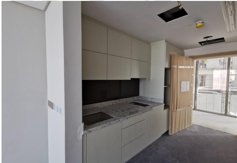
Installation of Kitchen and Painting Works at Typical Floors