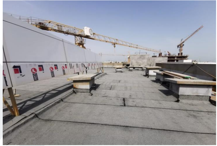
Waterproofing Works at Roof Floor