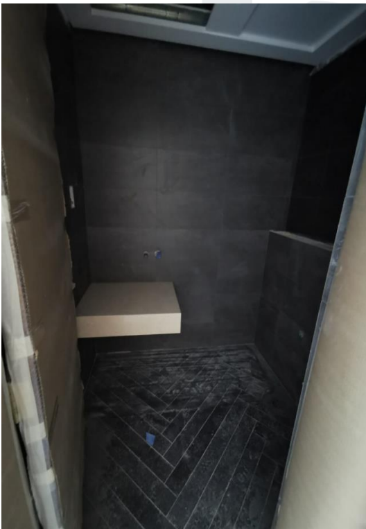
Tile Works for Toilet Area at Typical Floors