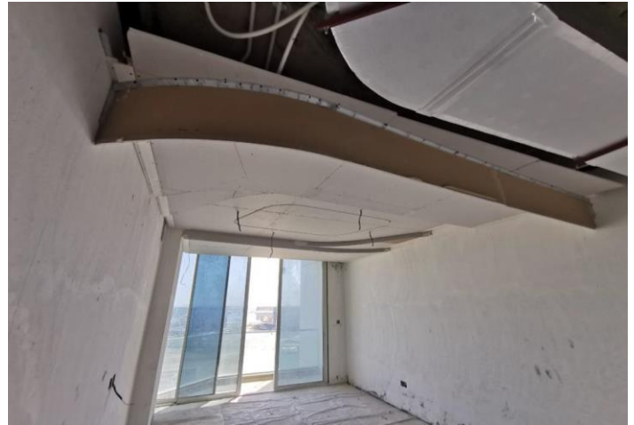
Gypsum Ceiling Works at Typical Floors