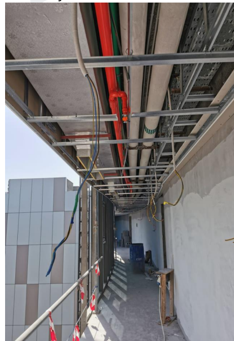
Installation of MEP Services at Typical Floors