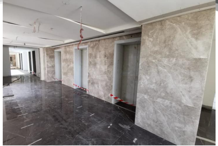
Marble Wall Cladding Works for Lift Lobby Area at Typical Floors