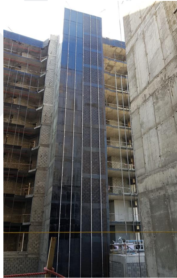
Installation of Aluminum Works (Brackets, Mullion, Rockwool, ACP Cladding and Glass and Application of Bitumen Paint)