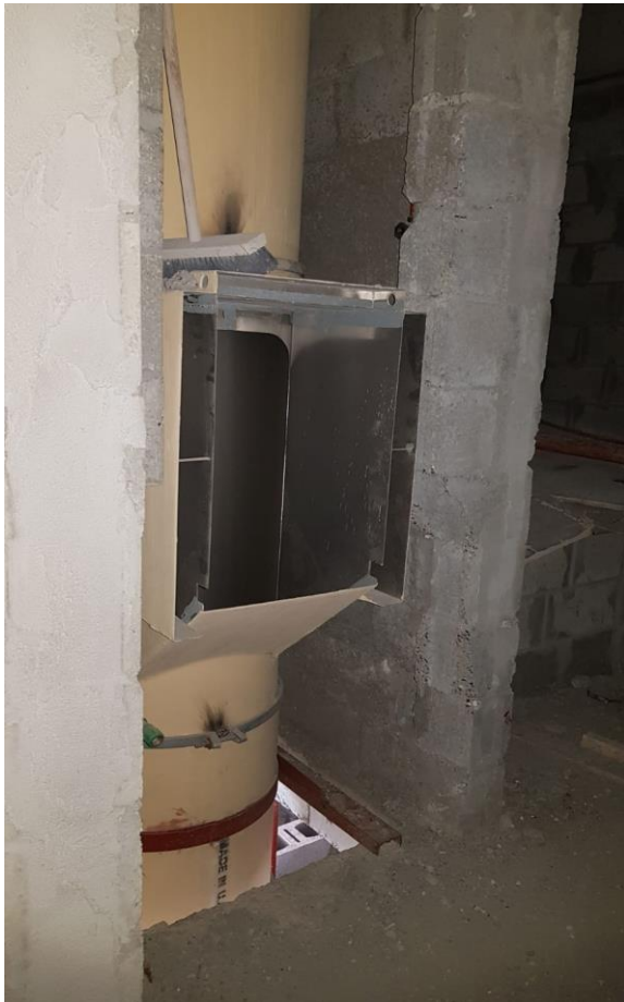
Installation of Garbage Chute at Typical Floors