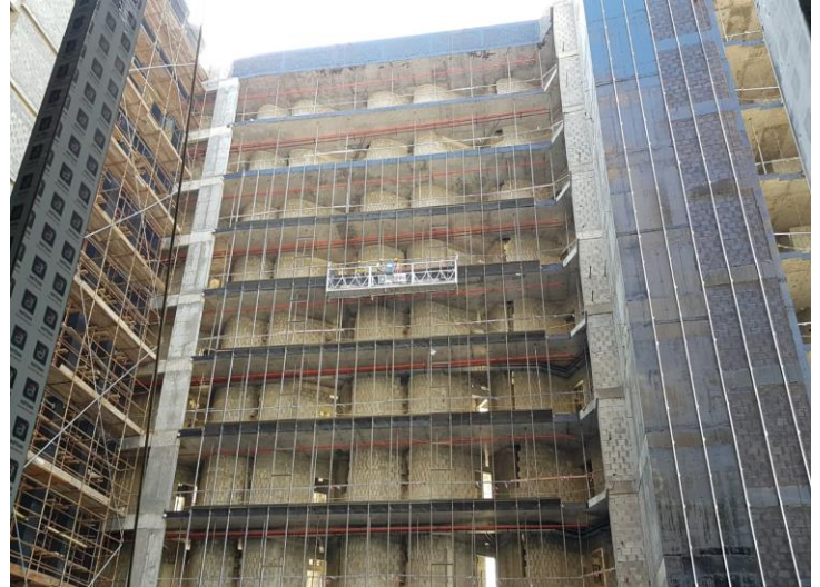
Installation of Aluminum Works (Brackets, Mullion, Rockwool, ACP Cladding and Glass and Application of Bitumen Paint)