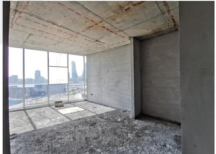
Plastering Works at Typical Floors