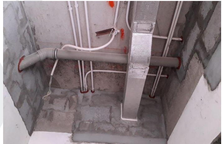
Installation of MEP Services at Typical Floors