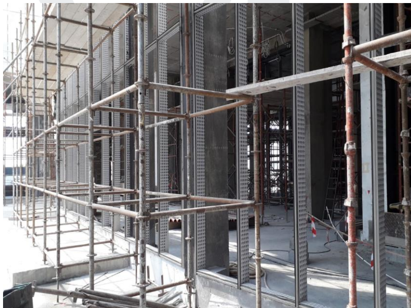
Installation of Aluminum Works (Brackets, Mullion, Rockwool ACP Cladding & Glass and Application of Bitumen Paint)