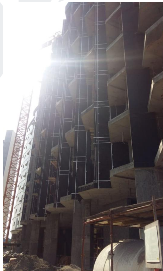
Gypsum Ceiling and Painting Works at typical floors