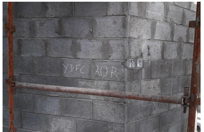
MEP Services Marking Works at Typical Floors