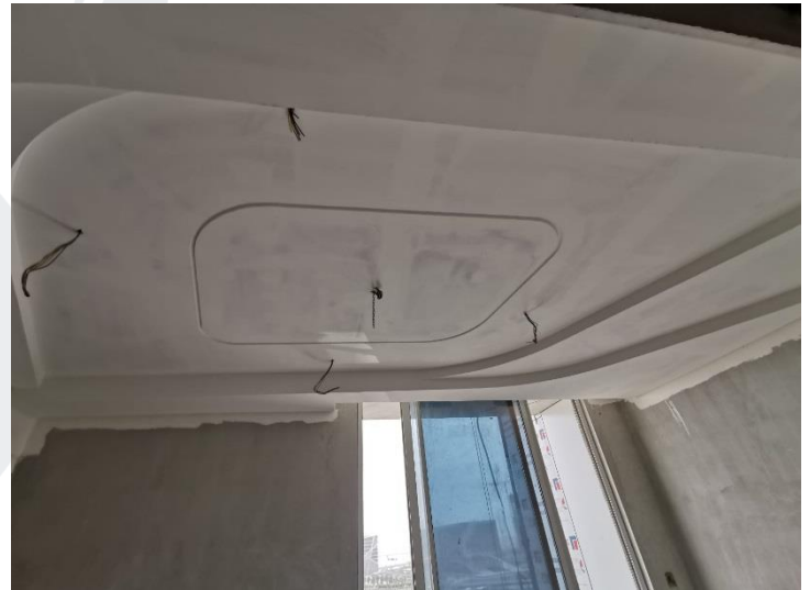
Gypsum Ceiling Works at Typical Floors