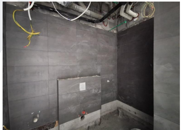
Tile Works for Toilet at Typical Floor