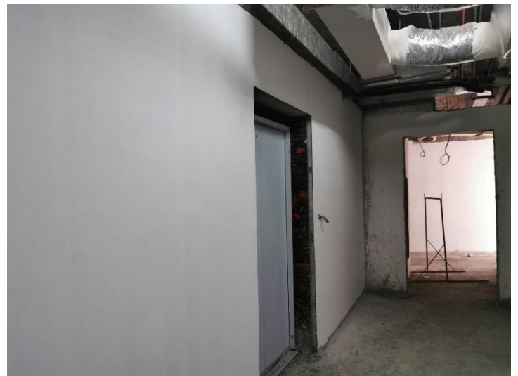
Application of Paint at Typical Floors