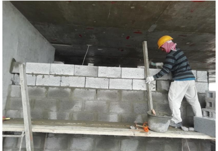
29 th Floor – Block Work