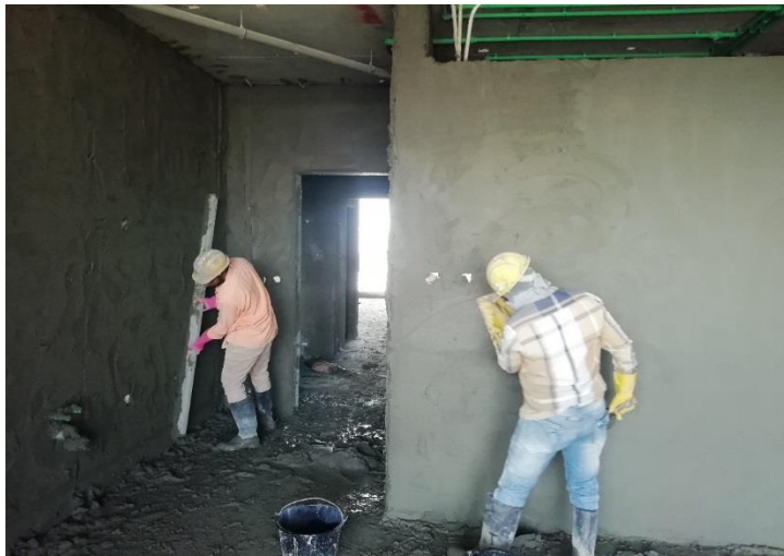
8 th Floor – Plastering Work