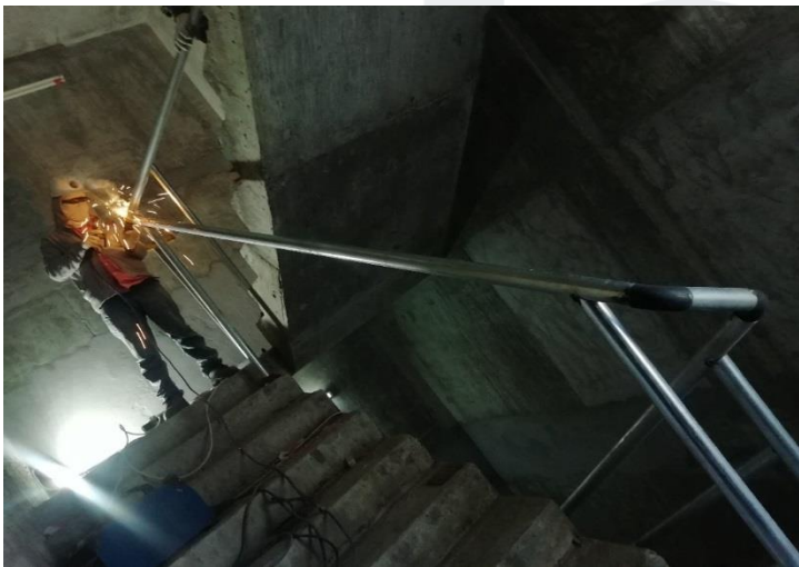
12 th Floor – Handrail Work for Staircase