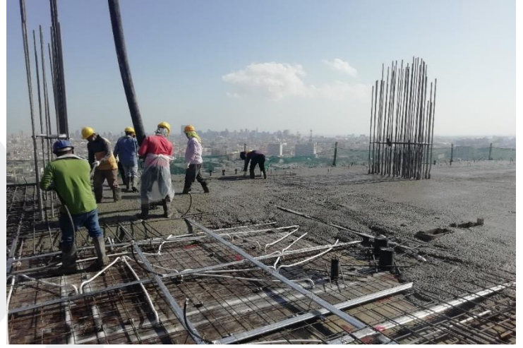
23 rd Floor – Concrete for Slab