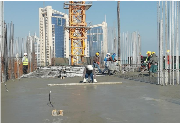
21 st Floor – Concrete Work for Slab