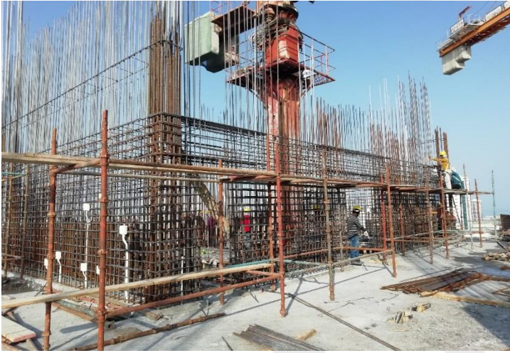
21 st Floor – Steel Work for Shear Wall