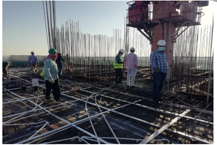
22 nd Floor – Steel work for Slab