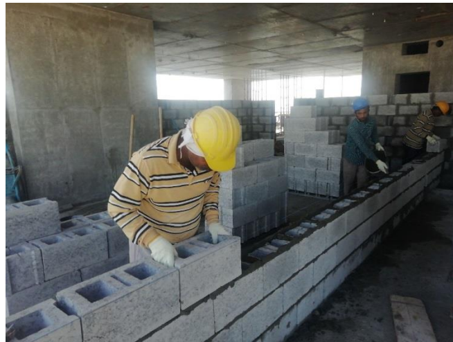
14 th Floor – Block Work