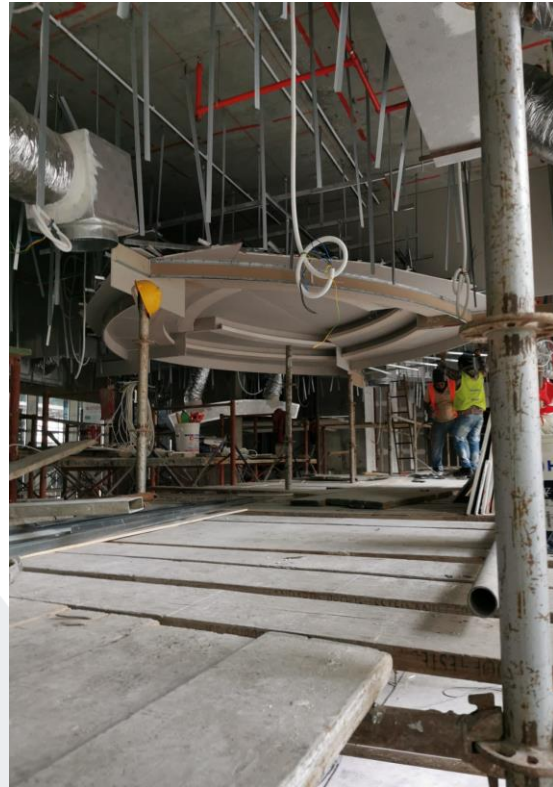
Gypsum Ceiling and Painting Works at Corridor Area (Typical Floor)