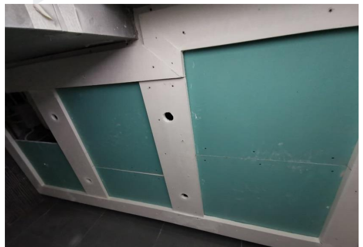
Gypsum Ceiling and Painting Works at Typical Floors