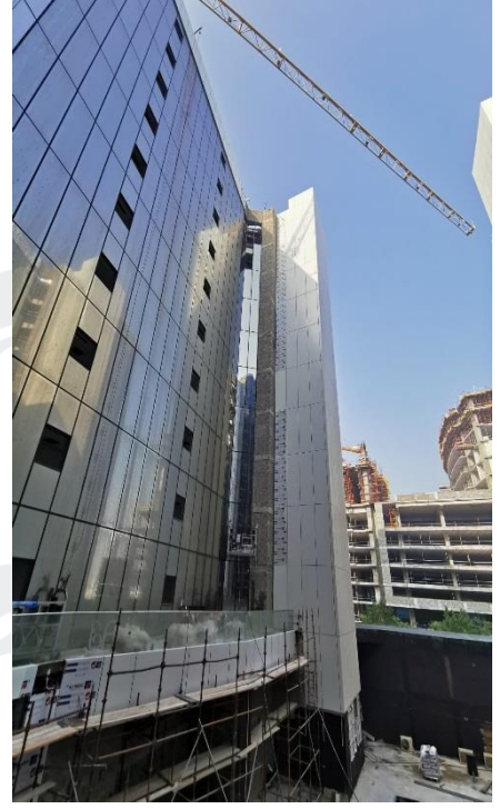
Installation of Aluminum Works (Brackets, Mullion, Rockwool ACP Cladding & Glass and Application of Bitumen Paint)