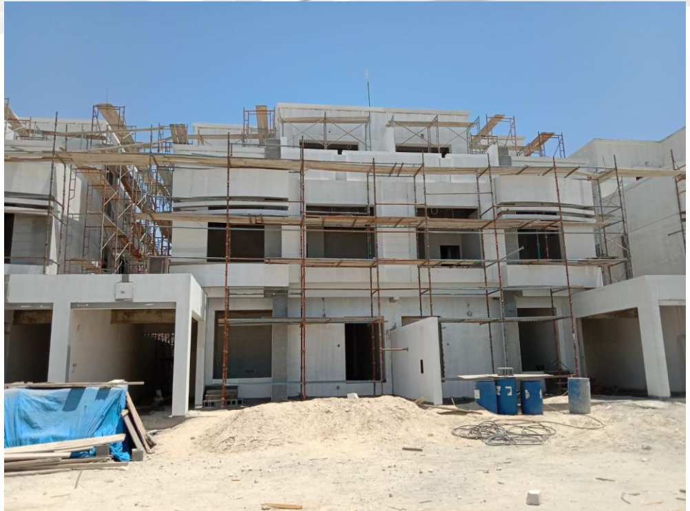
Villa 3 & 4 Overall View