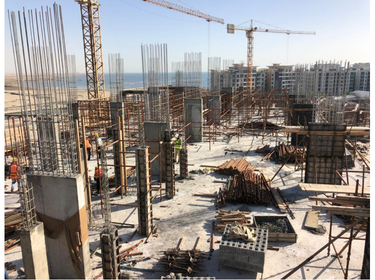
Zone 3 5 th Floor Columns Works