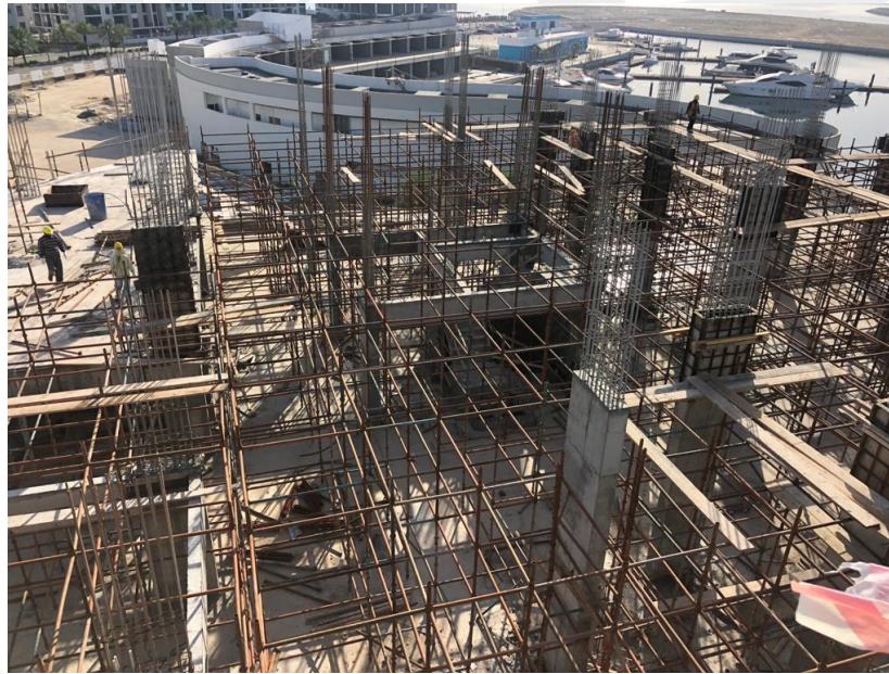
Zone 1 3 rd Floor Slab Works