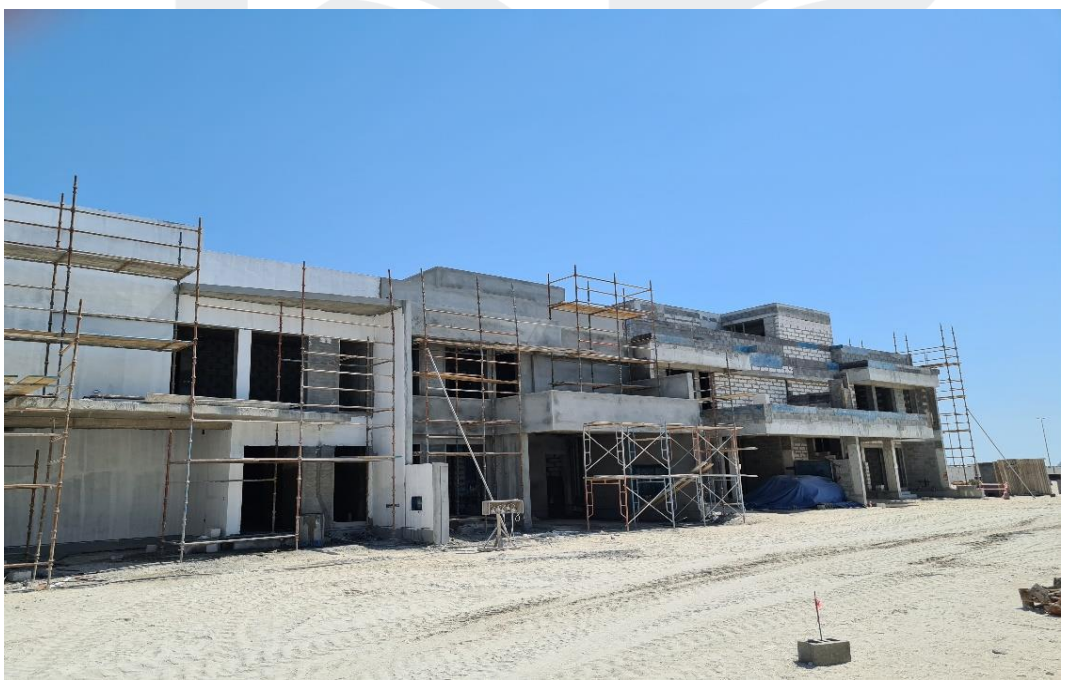
External Plastering Preparation works in progress