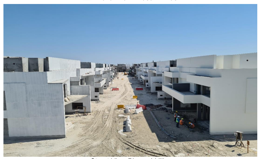
Street View Phase 1 Villas