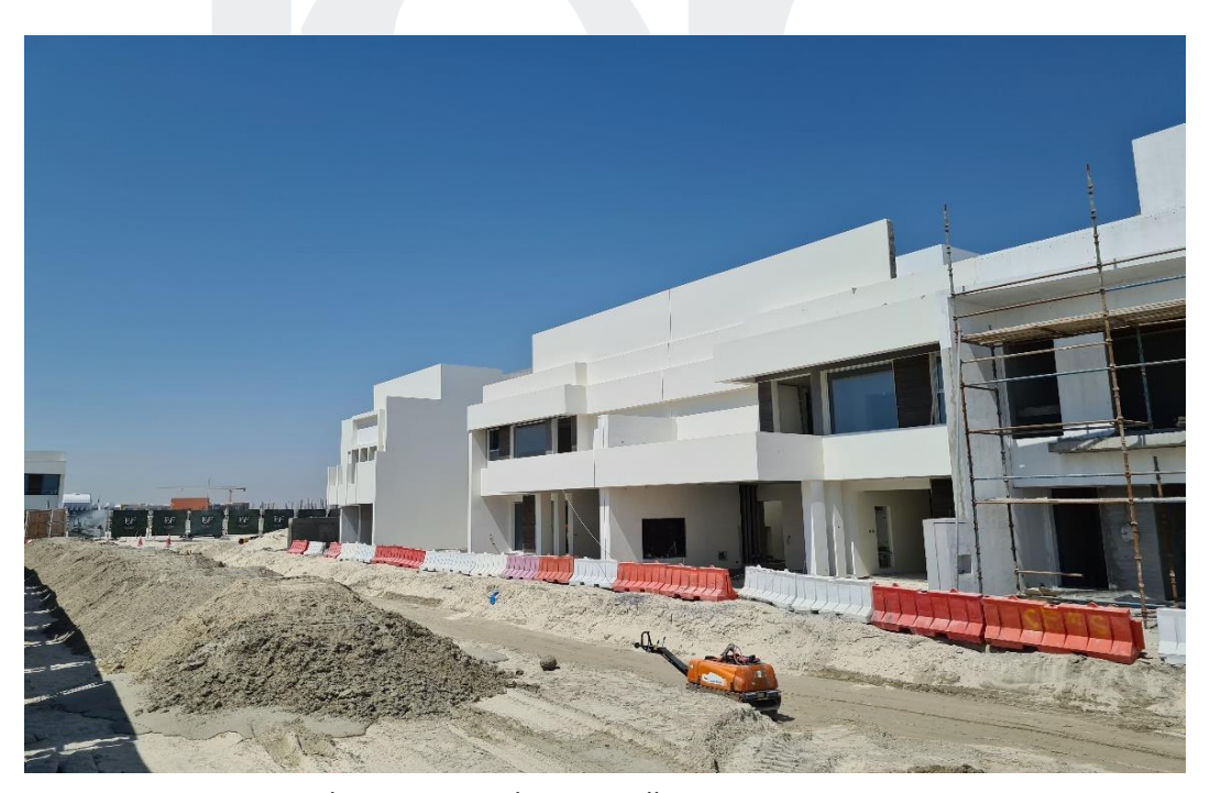
Aluminum Windows Installation in progress