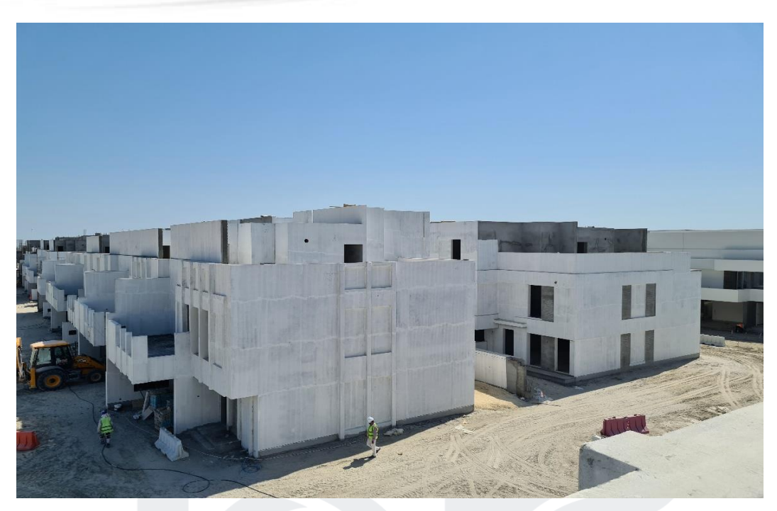
External Painting works in progress