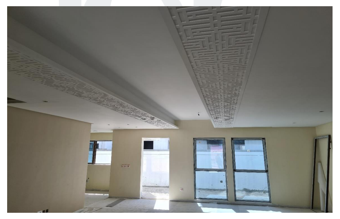
Ceiling works in progress