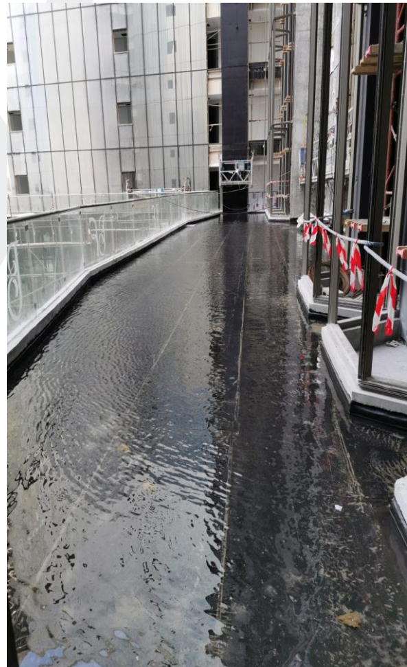
Waterproofing Works & Water Leakage Test for Terrace Area at 1 st Floor