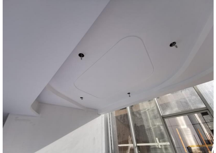
Gypsum Ceiling and Painting Works at Typical Floors