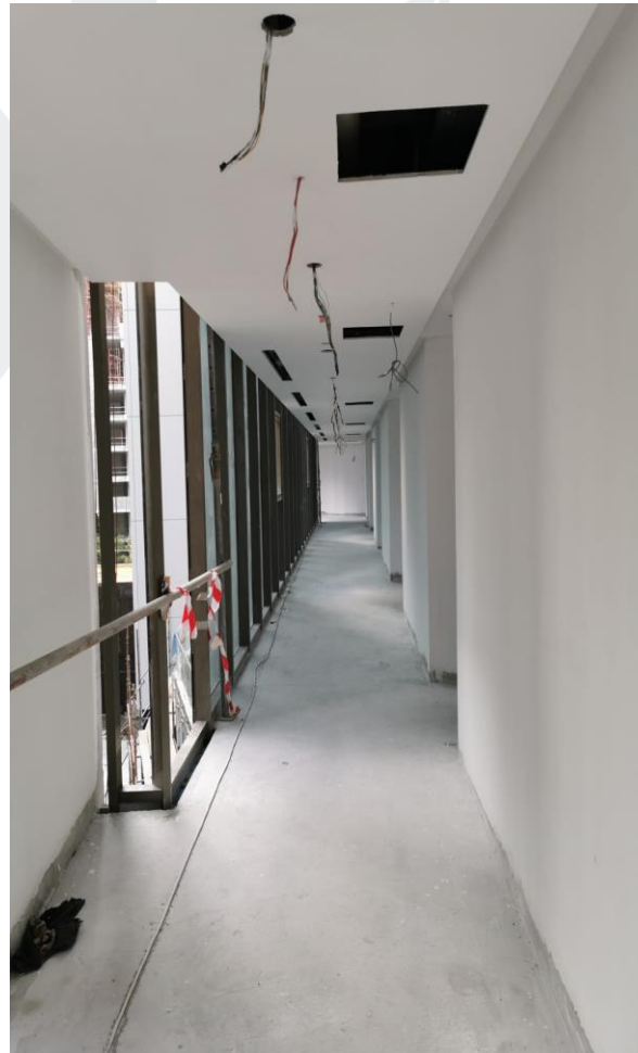
Gypsum Ceiling and Painting Works at Corridor Area (Typical Floor)