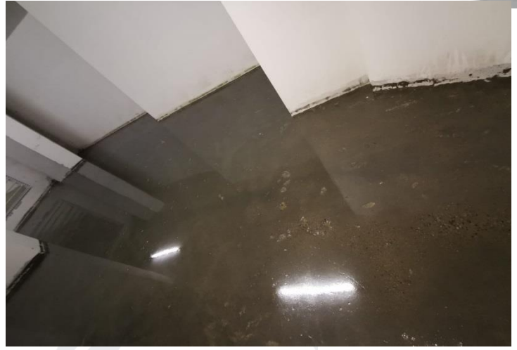
Water Leakage Test at Typical Floors