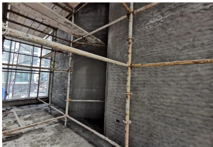
Plastering works at Ground Floor