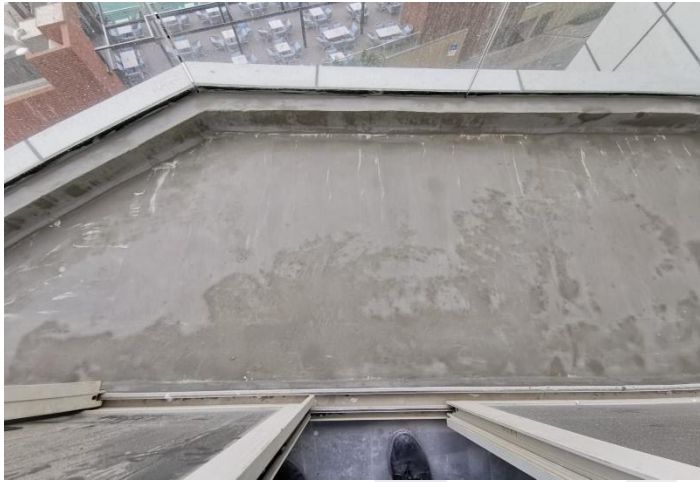
Waterproofing works for Balcony Area