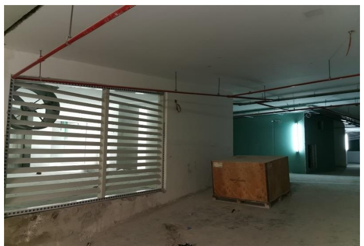
Service Area at Basement