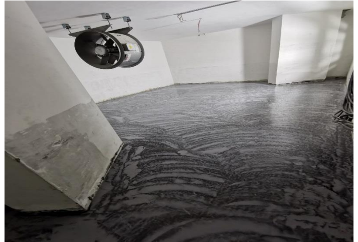
Water proofing works at Typical Floors