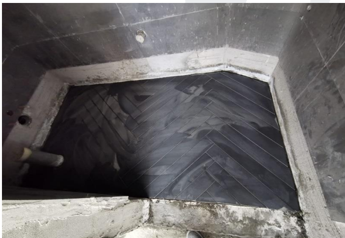
Fixing of Tiles for Toilet Area at Typical Floors