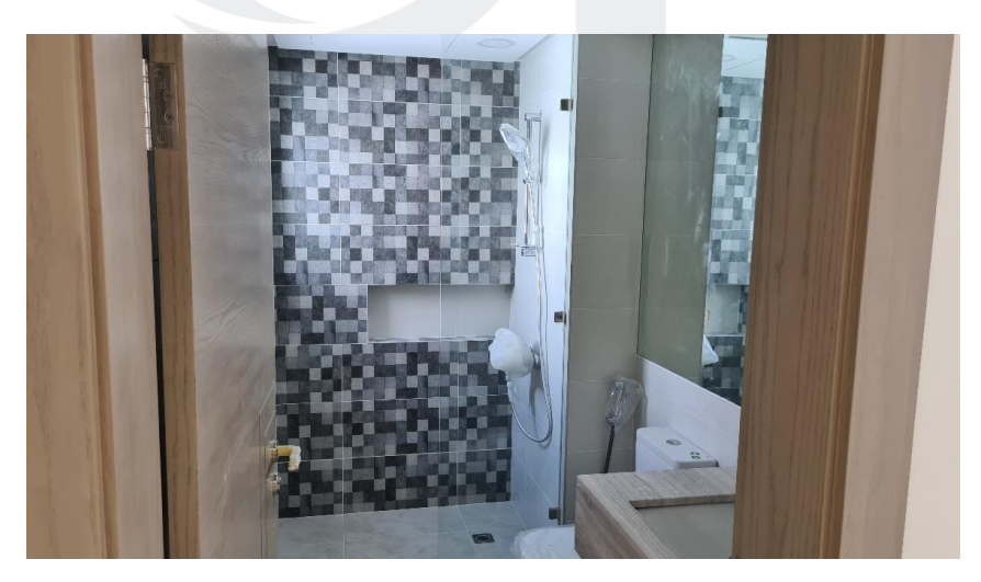
Staircase Handrail installation in progress