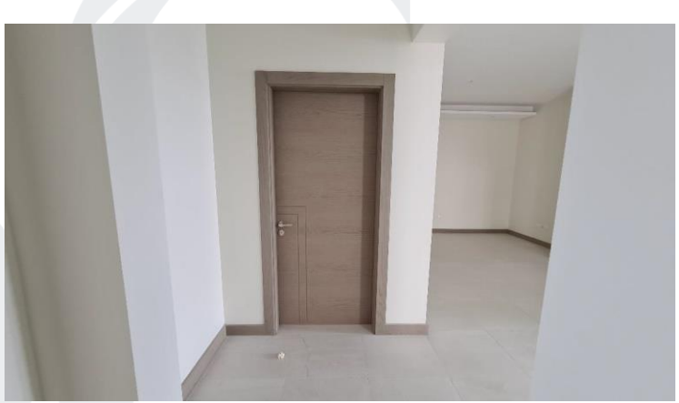
Internal Door Installation in Progress