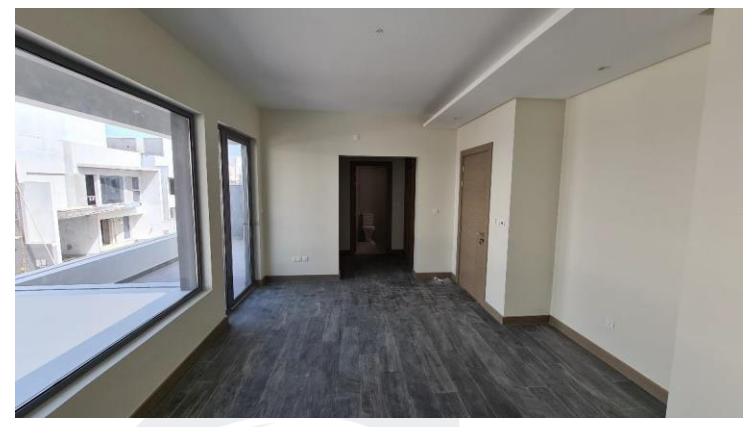
Aluminum Windows Installation in Progress