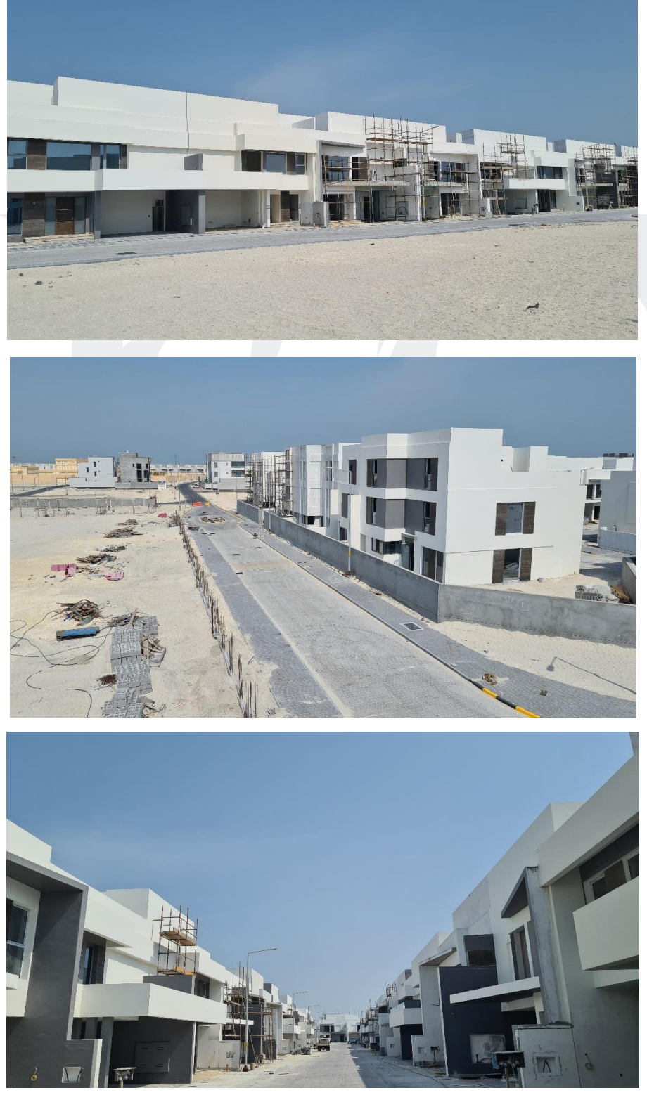
Street View Phase 1 Villas