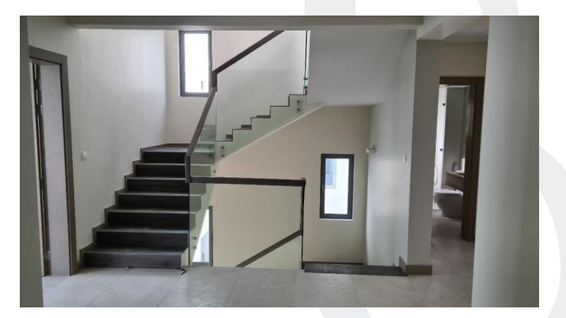
Staircase Handrail Installation in Progress