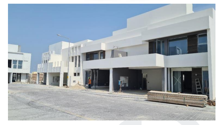
External Painting Works in Progress