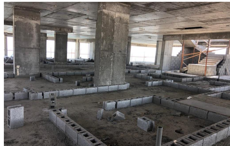
Zone 6 – 6 th Floor Block Works