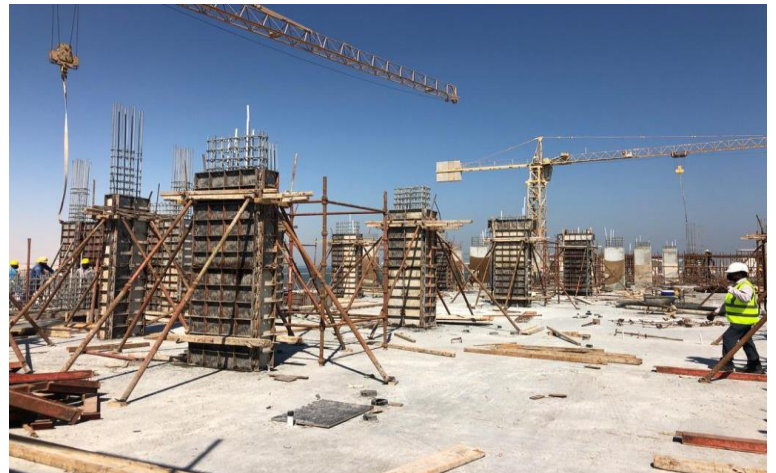
Zone 2 – 6 th Floor Columns Reinforcement and Shuttering Works