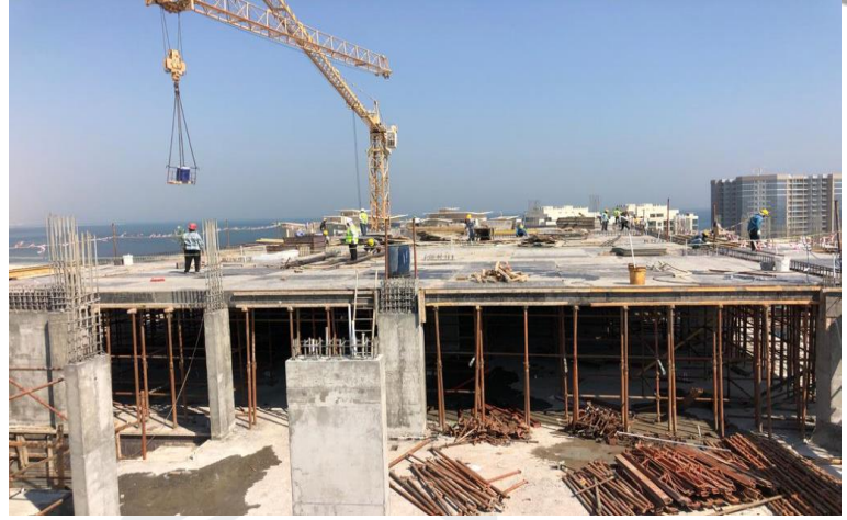
Zone 2 – Roof Slab and Beam Shuttering and Reinforcement Work