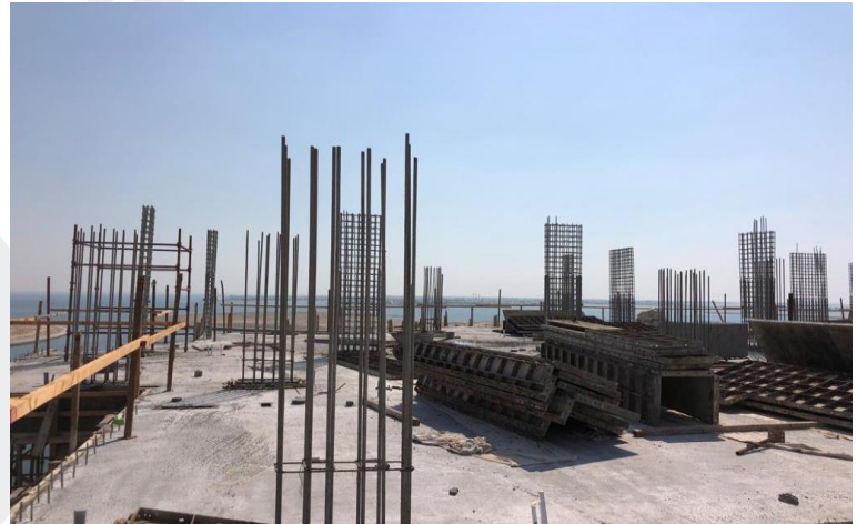
Zone 1 – 6 th Floor Columns Reinforcement Work