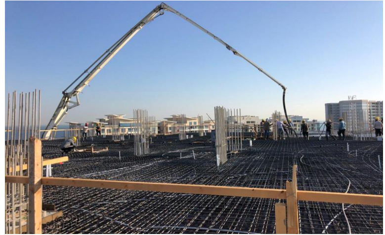
Zone 1 – 6 th Floor Slab and Beam Concrete