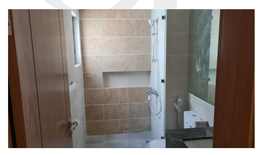
Villa Shower Partition Installation in Progress