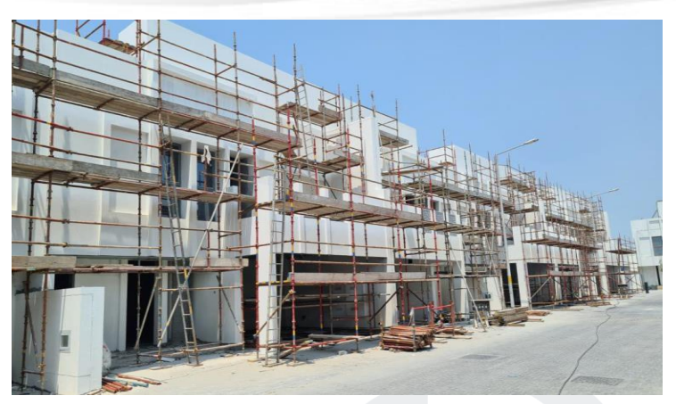
External Painting Works in Progress