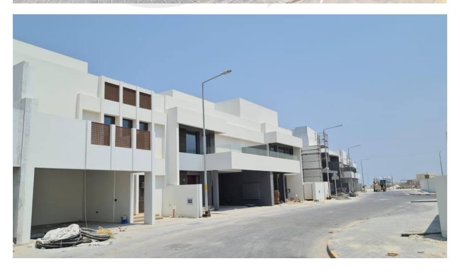
Street View Phase 1 Villas