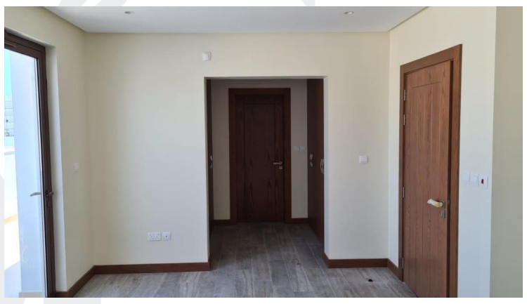
Internal Door Installation in Progress