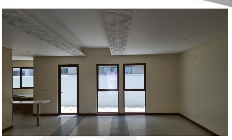
Internal Finishing Works in Progress