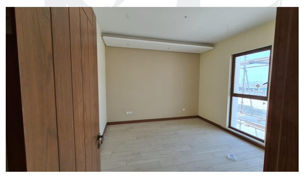
Floor Tile Works Final Finishing in Progress