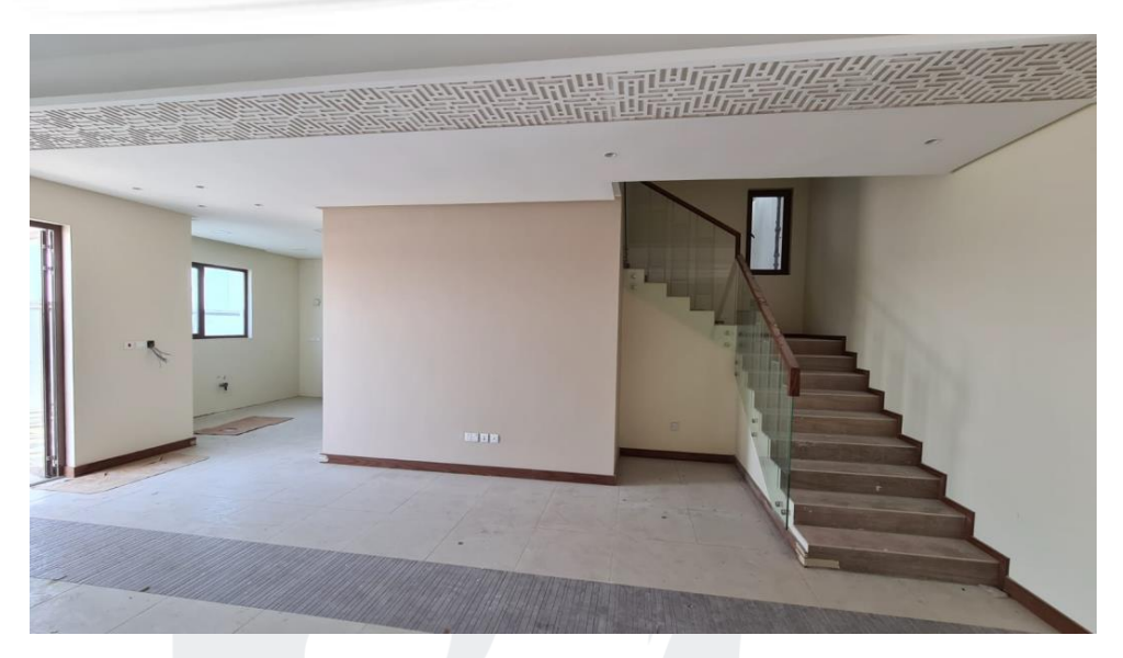
Internal Painting in Progress