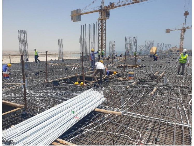
Zone 3 to 6 th Floor Slab