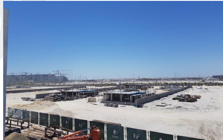
Aerial View of Phase 2 Villas