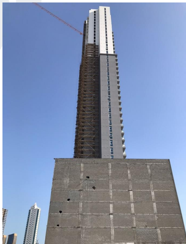
Left Side Elevation