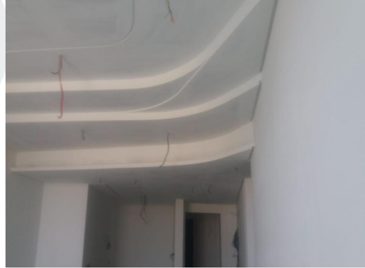
Gypsum Ceiling and Painting Works at Typical Floors