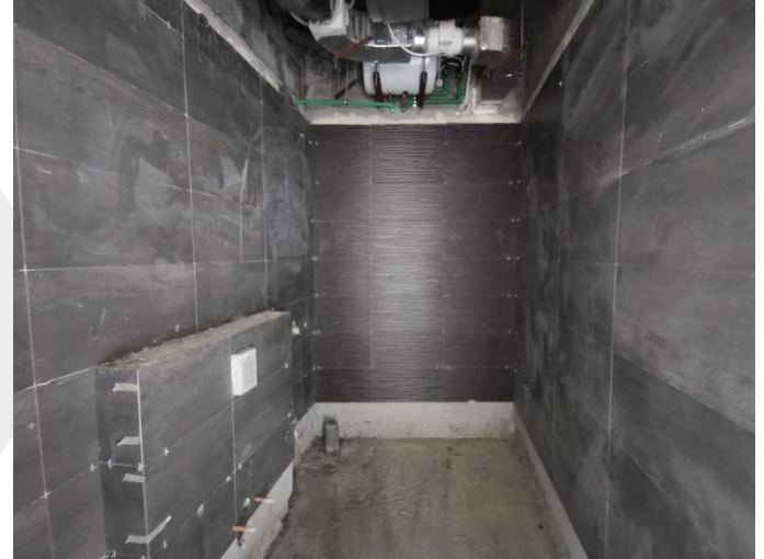
Tile Works for Toilet at Typical Floors