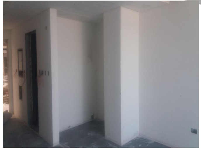
Painting Works at Typical Floor