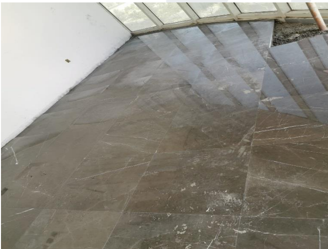
Marble Works at Typical Floors