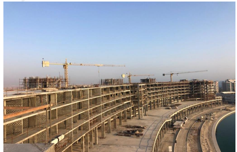
Upper Roof Columns and Slab Shuttering Work