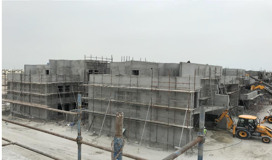
Aerial View Phase 1 Villas