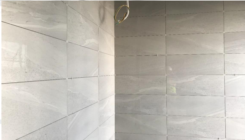
Wall Tiles Fixing in progress