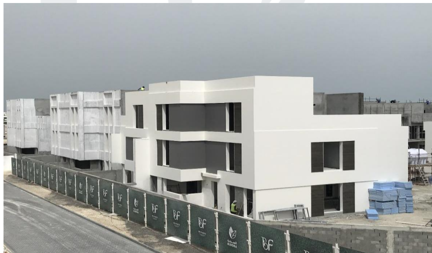
External Painting works in progress