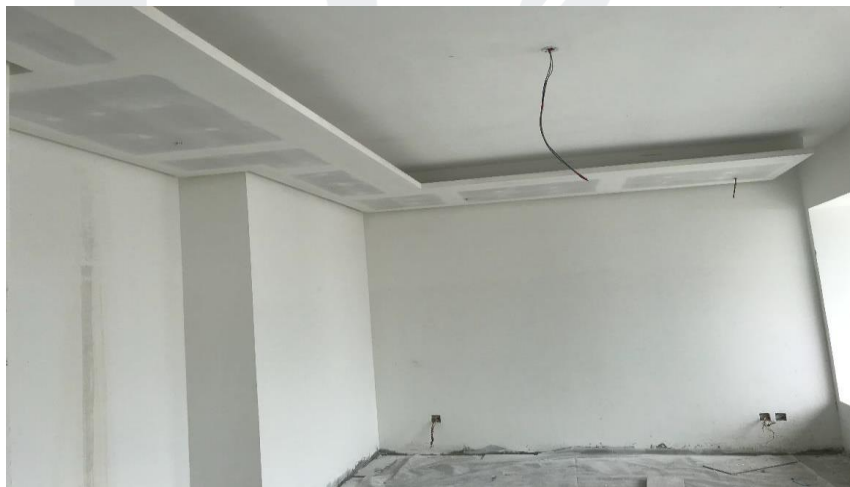
Ceiling Works in progress