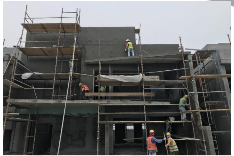
External Plastering works in progress