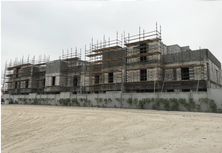
Plastering Preparation works in progress