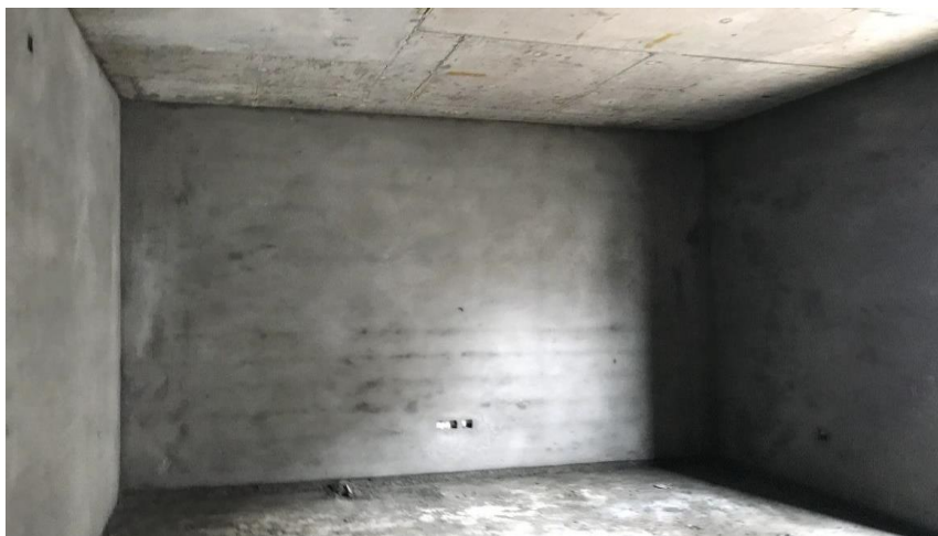
Internal Plastering work in progress