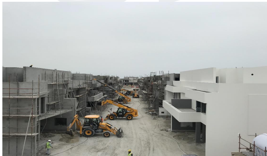
Street View Phase 1 Villas