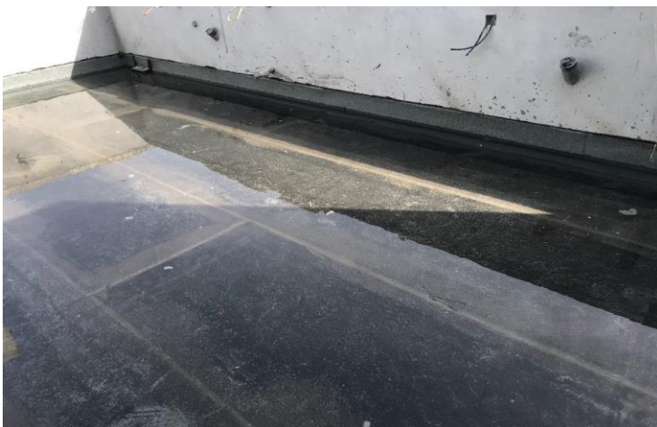
Roof Waterproofing works in progress