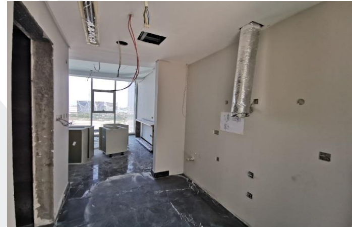
Painting Works at Typical Floors