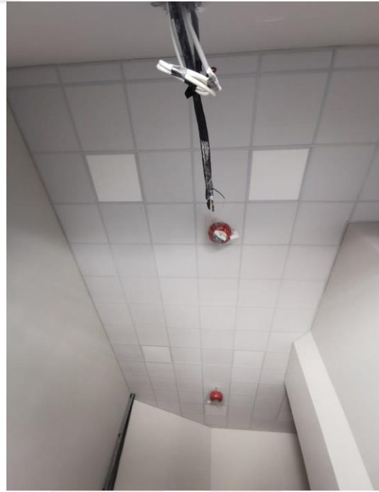
Installation of MEP Services