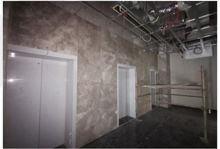
Marble Cladding Works at Typical Floors