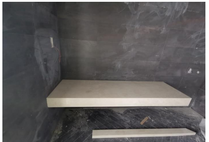
Tile Works for Bathroom at Typical Floors