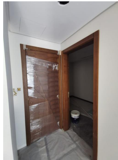
Fixing of Doors at Typical Floors