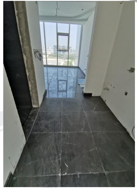
Marble Works at Typical Floors