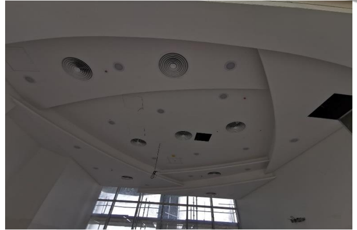
Gypsum Ceiling Works at Ground Floor