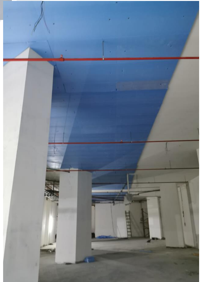
Thermal Insulation Under the soffit Slab