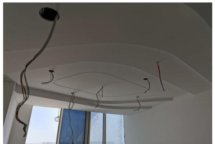
Painting Works at Typical Floors