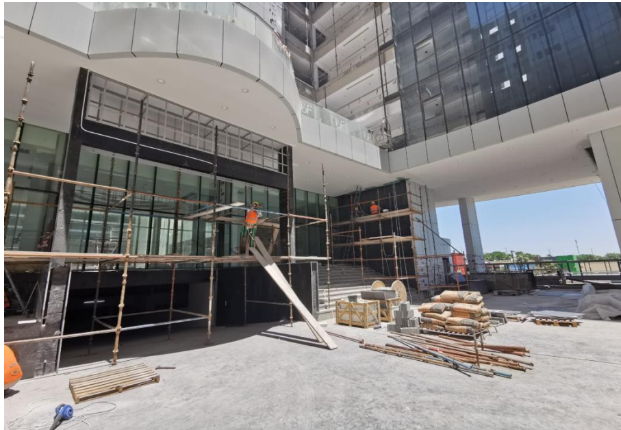
Installation of Aluminum Works (Brackets, Mullion, Rockwool ACP Cladding & Glass and Application of Bitumen Paint)