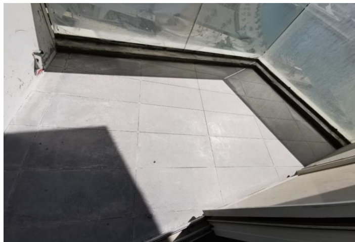
Tiling Works for Balcony Area at Typical Floors