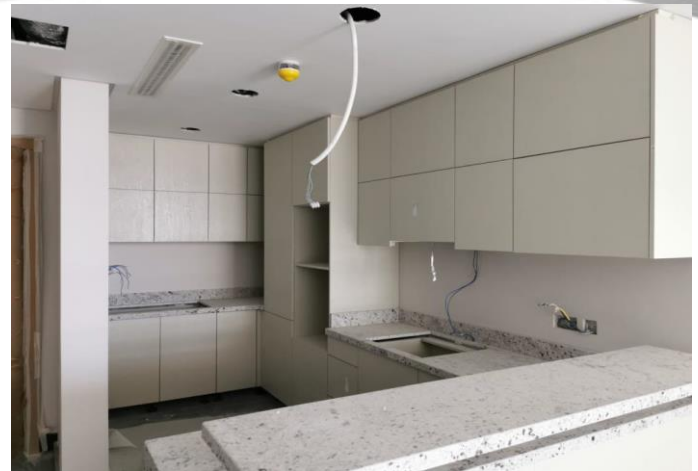
Installation of Kitchen and Painting Works at Typical Floors