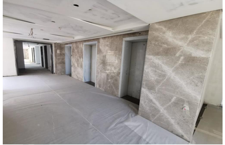
Marble Wall Cladding Works for Lift Lobby Area at Typical Floors