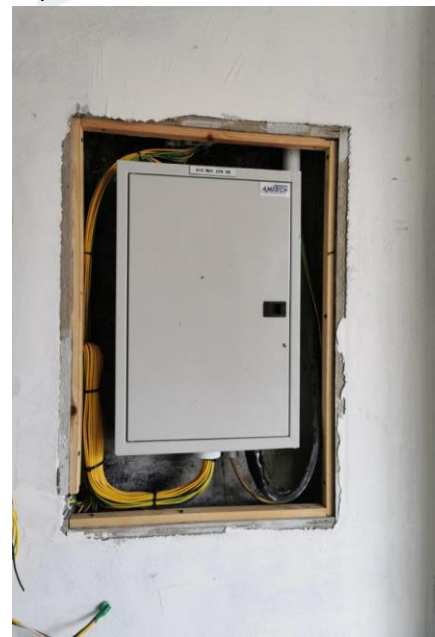
Installation of MEP Services at Typical Floors