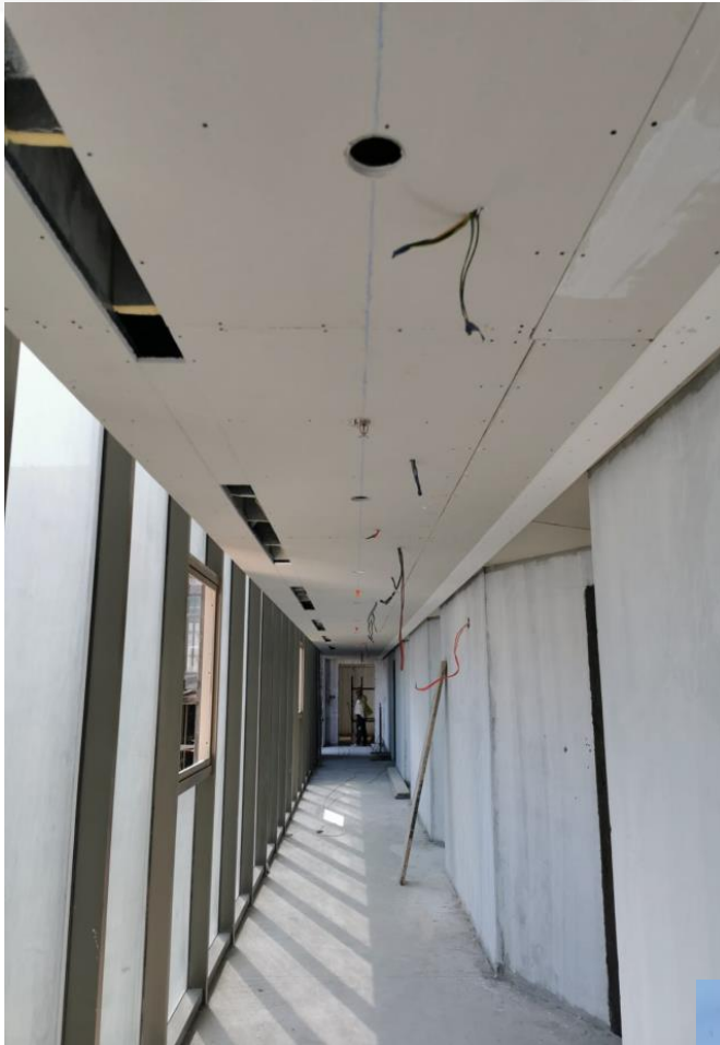
Gypsum Ceiling Works at Typical Floors