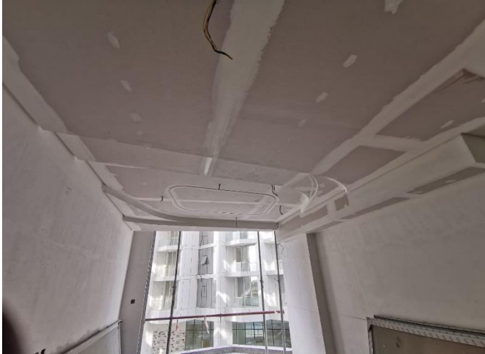
Gypsum Ceiling Works at Typical floor