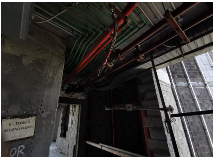
Installation of MEP Services at Typical Floor