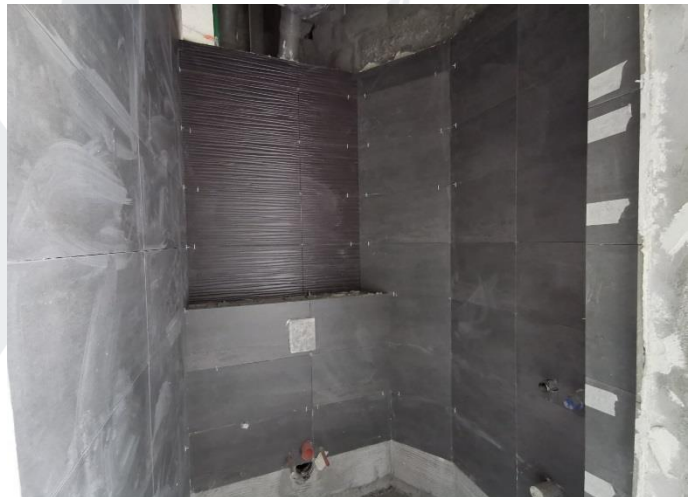
Tile Works for Toilet at Typical Floor