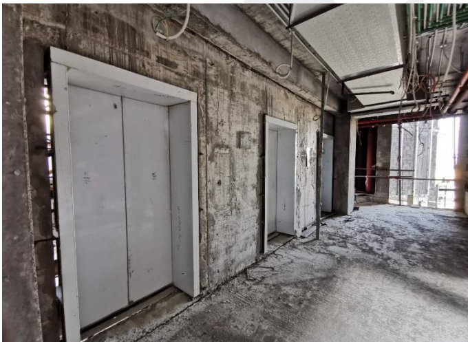
Lift Works at Typical Floor